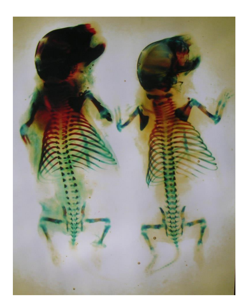
Fig (5): A photograph of dorsal aspects of two skeletons of full term PM fetuses treated by 8/mg of FX from 7-14 d of gestation showing that the fetuses have missed ossification of phalanges fore and hind limbs and lack of ossification in pelvic girdles and ribs.