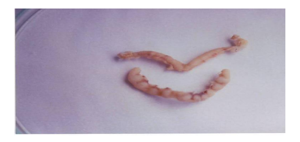
Fig (2): A photograph of uteri of two P.M. pregnant rats at the 21<sup>st</sup> day of gestation treated with 8mg/kg of Fluoxetine at (7-14 days) of gestation showing: A) Hemorrhagic spots denoting abortion. B)Complete resorption of fetuses.

Fig (1): A photograph of two uteri of pregnant rats at the 21<sup>st</sup> day of gestation showing: A) Normal symmetrical uterine horns of a control N.F pregnant rat. B) Asymmetrical uterine horns of a N.F pregnant rat treated with 8mg/kg of fluoxetine at (7-14 days) of gestation.