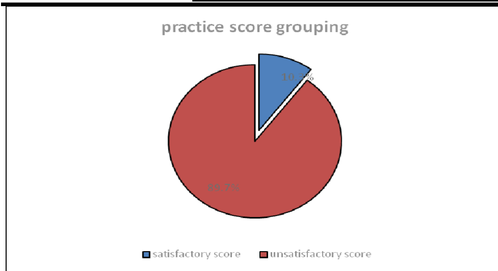
Figure (2) Distribution in percentage of Sample as regards to Practice Level about Central Line Care Bundle (N = 58)