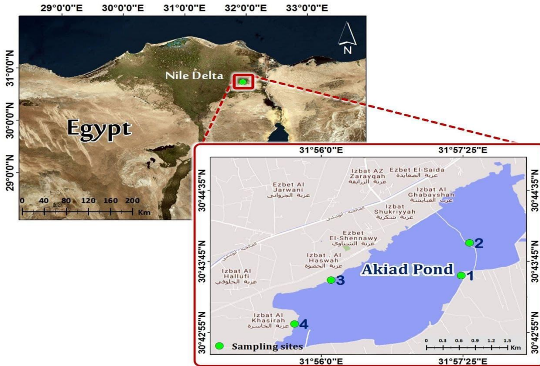
Figure 1. Google Earth satellite image showing the location of the four surveyed points at Akiad Pond, Sharkia Governorate, Egypt.