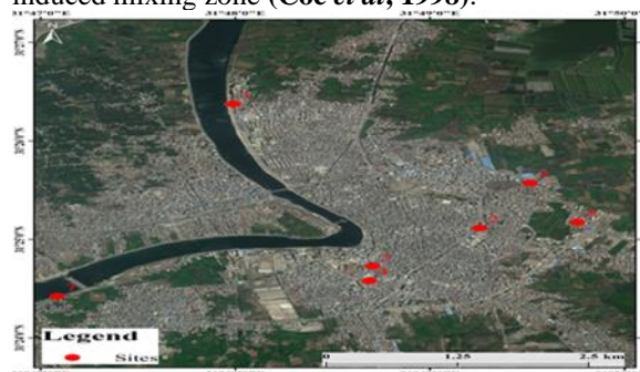
Map (1): Samples Locations of the Investigated Sites at Damietta City, Damietta Governorate, Egypt.

In the present study by using Global Positioning System (GPS), PM had collected at the seven locations in Damietta city (Map 1) over a period of year during 2018 and then comparing with our previous study of year 2009 (El-Henawy, 2011). The locations of samples had selected by their strategic positions with the traffic density and commercial activities. Samples were collected from: Al-Harby Street (location 1), Bab Al-Haraas (location 2), El-Matary Bridge (location 3), Abd Al-Raheem Nafea Street (location 4), Souror Square (location 5), Gheit El-Nasara (location 6), and Damietta Lock and Gates Bridge (location 7). Locations (6 and 7) had selected because they were outside the potential influence of high traffic; Gheit El-Nasara and Damietta Lock and Gates Bridge. Sampling Locations were located on both sides of a street at a distance of \geq 3\text{m} from the traffic lanes, in order to be outside of the traffic induced mixing zone (Coe et al. , 1998).