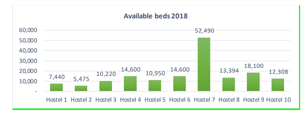
Figure 2 Total number of beds available for each hostel for the year 2018

Regarding the total number of beds, it is evident in Figure 2 that hostel 7 is the one with the highest number of beds available with 52,490 for the year 2018, and the one with the fewest beds was hostel 2 with 5,475 beds available for the year 2018.