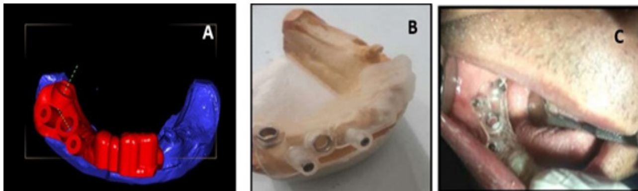
Figure 2: (A) Surgical guide virtual 3D design on DDS-Pro software. (B) the same surgical guide after being printed and seated on the cast with the sleeves incorporated. (C) the surgical guide after being checked in the patient's mouth.

Deviation between planned and actual implants was measured according to the method commonly used by previous researchers in this aera through assessment of the following measurements [10] (Figure 3 E).