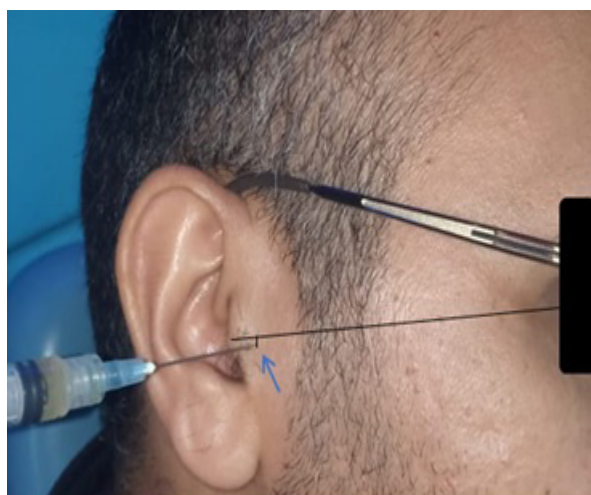
Figure 2: A case in group II where the synovial fluid-mesenchymal stem cells are injected into the joint through a point on the tragus-outer canthus line 10 mm anterior to the tragus and 2 mm inferior to the line as the blue line indicates.

All laboratory work was done at Alberg advanced labs.