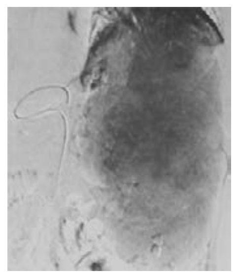
Fig 1: Splenic arteriogram, obtained before the procedure.

If a splenic abscess was suspected (by prolonged high grade fever, persistent agonizing left hypochondrial pain, signs of toxemia or neutrophilia in CBC), CT abdomen was done.