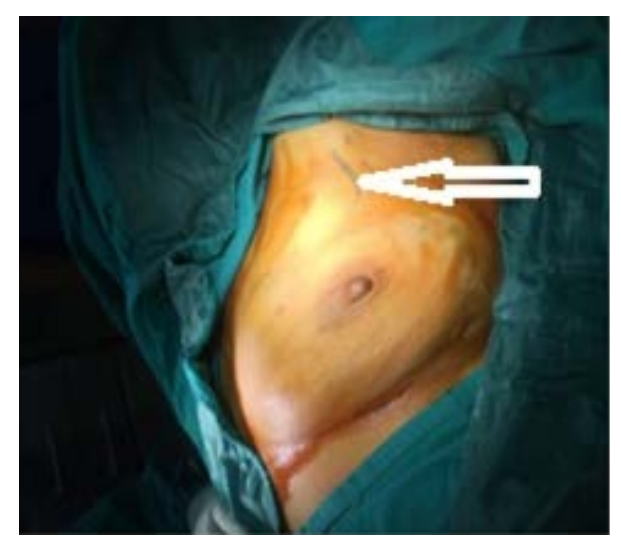
Fig 2: Lateral incision directing toward areola.

We deepened the incision into the superficial plane of subcutaneous tissue, the margins of the skin flap were held upward using skin hooks with the