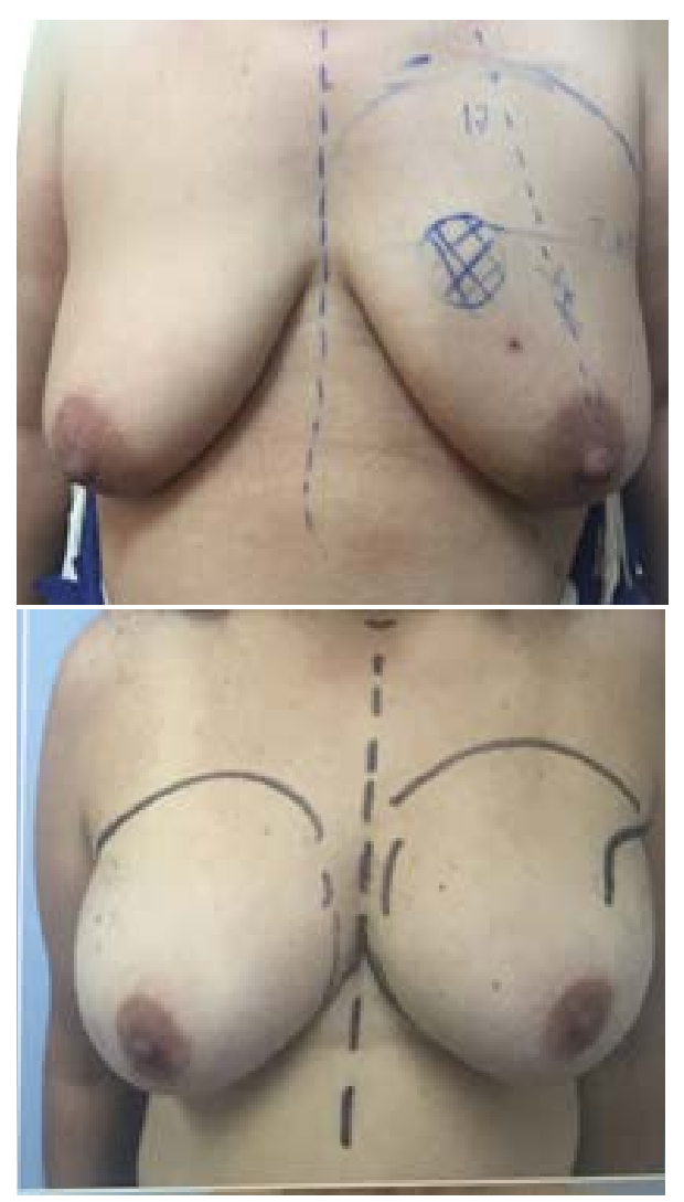
Fig 1: Marking of boundaries of the breast mound prior to incision while the patient in erect position.

A superolateral radial incision (Figure 2) was used through which mastectomy and axillary clearance were done. In patients who required removal of the NAC and overlying skin, an extension of the incision to encircle the areola was preferred allowing excellent exposure. We typically avoided the medial incision so as not to disrupt the abundant blood supply to the nipple from the internal mammary perforators as was demonstrated in Crowe's experience.<sup>4</sup> Moreover, reconstruction with implants is extremely difficult through a medial incision. (Figure 2).