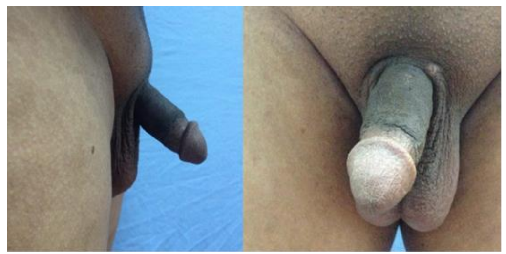
Figure (4): The length of the penis one week after positioning of semi-rigid implant through Subcoronal approach

Among patients treated with the subcoronal approach, one patient developed penile extrusion one and half months postoperatively due to wound dehiscence secondary to uncontrolled DM. Furthermore, three patients were unsatisfied with the penile girth, and after psychiatric consultation, they suggested enhancement penile girth if available to achieve the desired patient's outcome. As the mainline of psychological treatment of these cases, we used autologous fat transfers to augment the girth and giving soft padding around the prosthesis. The fat Coleman's harvested by harvesting cannula from trochanteric area without any use of the tumescent solution and transferred in subcutaneous plan with blunt tip fat injection cannula. The three cases accepted limited fat absorption, which did not exceed 20% of the injected