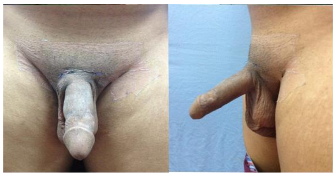
Figure (3): The length of the penis one week after positioning of semi-rigid implant through infrapubic approach

cm). This status was continued for six months in which no patient lost his penile length ( Figures 3 and 4 ).