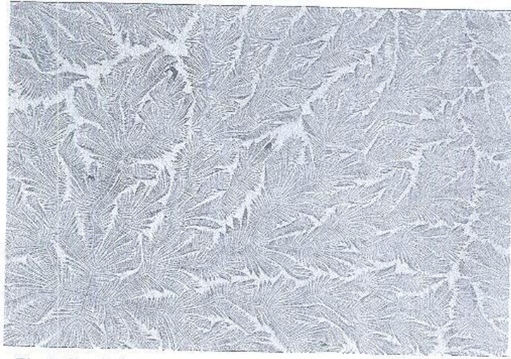
Fig. 2: Cervical mucus showing typical fern pattern during estrous cycle. Note the highly arborization of the fern (40x)