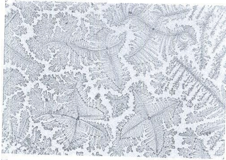
Fig. 4: Cervical mucus showing a medium-size fern pattern during estrus (40x)