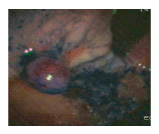
Figure 3: Mucosal tattooing using methylene blue, with excellent hemostasis.