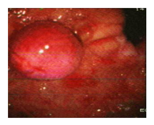
Figure 2: Dieulafoy's lesion after banding.

Figure 1: Active blood spurting from Dieulafoy's lesion.