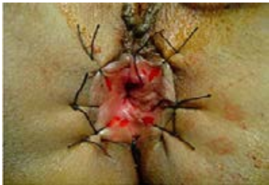
Fig 2: Everted canal using vicryl stitches.

The perineal part of the procedure started by everting the anal canal using eight vicryl stitches (1/0), instead of using the Loan Star retractor. This was followed by rectal mucosectomy (transanal dissection) in which the rectal mucosa was stripped from the dentate line. Mucosectomy was continued proximally till the distal cut end of the rectum. (Figures 2-4).