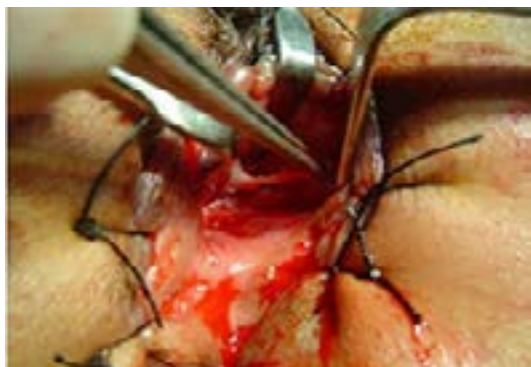
Fig 3: Performing rectal mucosectomy.