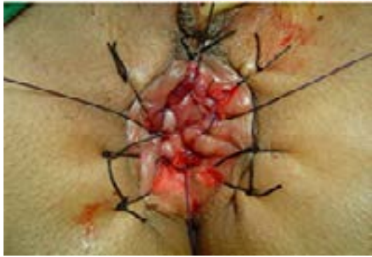
Fig 6: Performing CAA with mild tension over the four stay sutures.

After completing the anastomosis, the rectum was placed back into the pelvis followed by suturing the peritoneum of the mesentery to the pelvic wall to seal the pelvis off from the peritoneal cavity. (Figure 7) Then covering loop ileostomy was done.