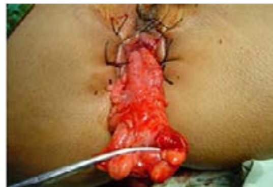
Fig 5: Passing the proximal colon out through the anus preserving its mesentery posteriorly.

The stay sutures in the proximal stump were pulled through the distal one until coming out from the anus, keeping its mesentery in its anatomical posterior position without twisting the colon. Any tension on the proximal colon during this step was avoided, allowing its passage through the anal canal smoothly to reach an adequate distance permitting an easy accessible anastomosis. (Figure 5).