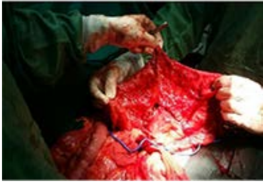
Fig 1: Adequate mobilization of the colon with preserving the marginal blood supply for tension-free hand-sewn CAA.

Dissection distal to the peritoneal reflection was continued to the level of the pelvic floor. The muscular rectal wall was divided at the level of the ano-rectal ring then the specimen was retrieved through the laparotomy incision, making sure that there was a proper blood supply at the proximal end, and then, four stay sutures (full thickness) at the proximal colonic edge were taken.