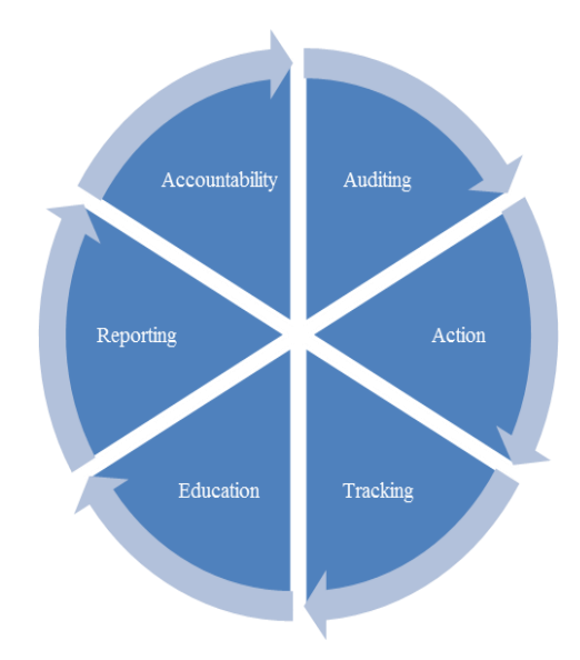
Fig. 2. The core elements of antimicrobial stewardship program