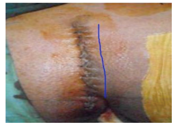
Figure (12): Off midline wound toward left side.