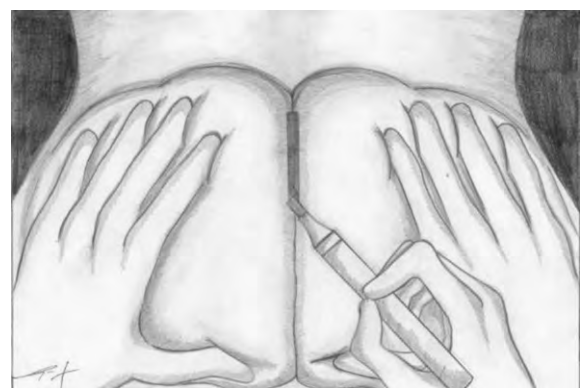
Figure (1): Drawing natal cleft border. Drawing done by my clinic Filipino nurse: Gian C. Victoria.