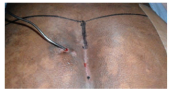
Figure (13): Branched pilonidal sinus with lateral opening.