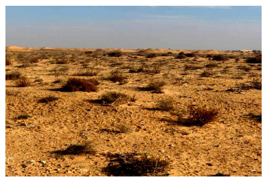
Figure (2): showing floristic composition and most plant communities in the study area.