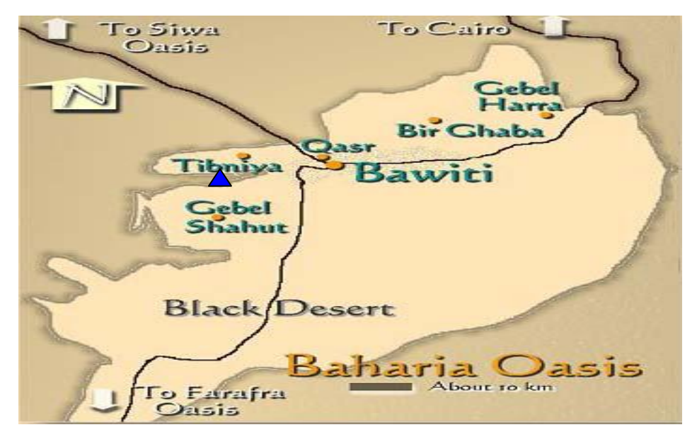
Map 2. Distribution of the parasitoid, Comperiella lemniscata in Baharia Oasis