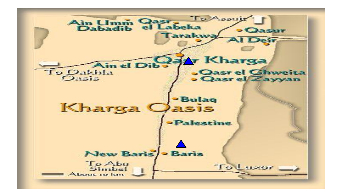
Map 5. Distribution of the parasitoid, Comperiella lemniscata in Kharga Oasis