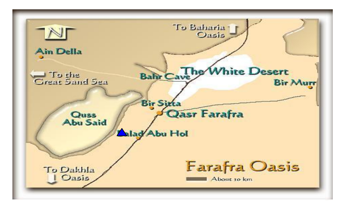
Map 4 Distribution of the parasitoid, Comperiella lemniscata in Farafra Oasis