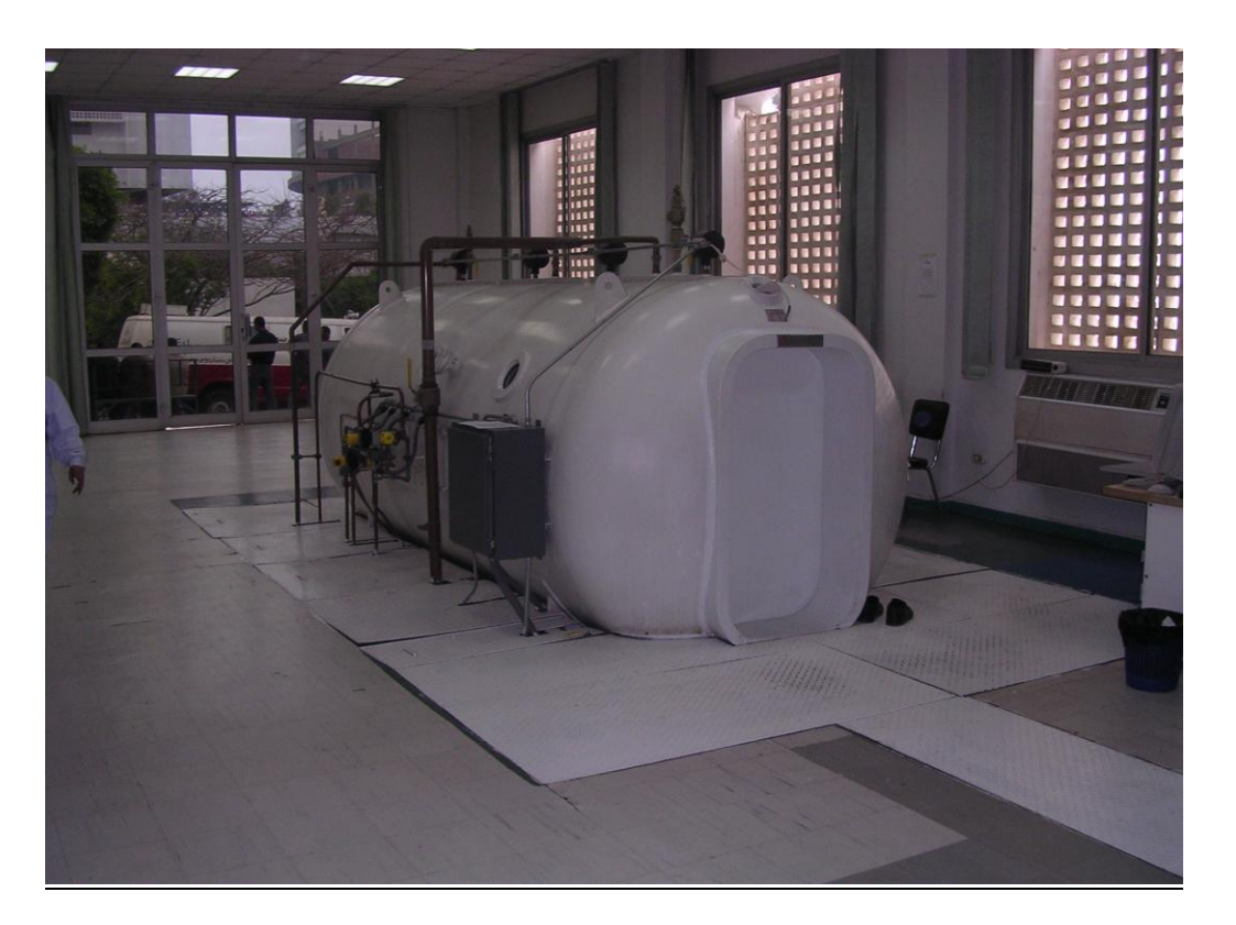
Figure (1) The Hyperbaric chamber.