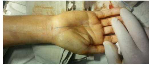
Fig 2: Picture showing incision at wrist crease.

of two longitudinal lines from the third web and cardinal line of Kaplan, eventually to guarantee that the TCL was fully resected, determining that there was no resistance by vertically testing the tip of the Metzenbaum scissors over the TCL.