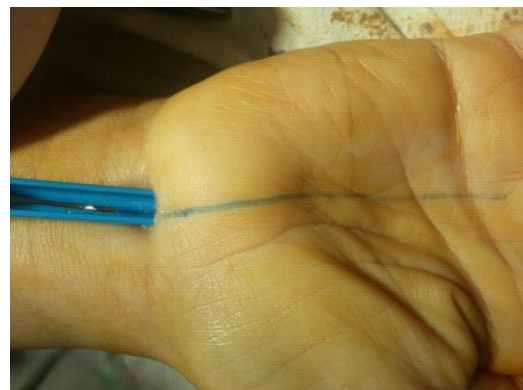
Fig 5: Picture showing release of the TLC.

After complete resection of TCL, irrigation of the incision, followed by the closure of the skin by interrupted suture with blue nylon 5-0 (Figure 6), the bulky dressing was done with mild compression and splint application in the position of mild wrist extension. Stiches were removed around 10 to 15 dayed. Follow up of all patients at our institute, after