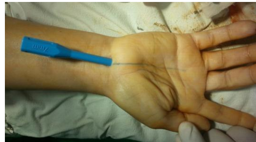
Fig 3: Picture showing free dilator.