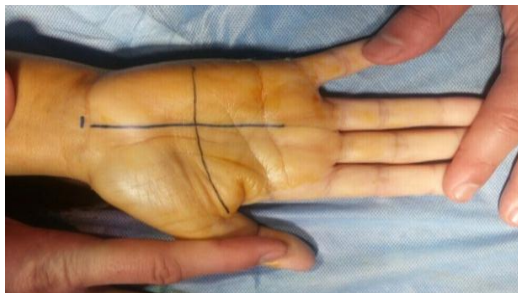
Fig 1: picture showing incision landmarks.

All patients had been surgery under local anesthesia using a tourniquet with pressure between 200 and 2500 mmHg. Supine position, precise knowledge of district anatomy is necessary for good surgery with this technique, in particular, the identification of the so-called secure canal in the carpal tunnel, in which some landmarks guided to the safe canal, volar proximal crease of the wrist, Palmaris longus tendon, cardinal line of Kaplan, distally to it can draw the skin projection of the superficial palmar arch. All are to a safe superficial palmar branch of median nerve protection at the radial side, the ulnar neurovascular system at the ulnar side, and distally to protect superficial palmar Vascular arch. (Figure 1).