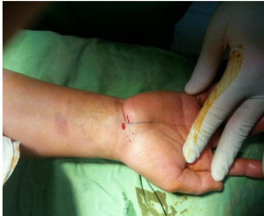
Fig 6: Picture showing closure of the wound.

one week, 2 weeks, 3 months, 6 months, and 12 months.