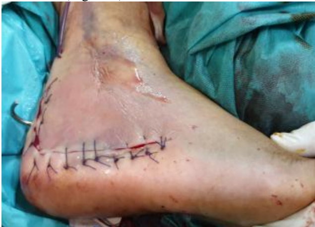
Figure (4): Closure and drainage.

There was no need for the use of bone graft in all cases. Irrigation and proper hemostasis were done and closure was done in a layered fashion with absorbable suture vicryl (2-0), and a drainage tube is also used (Figure 4).