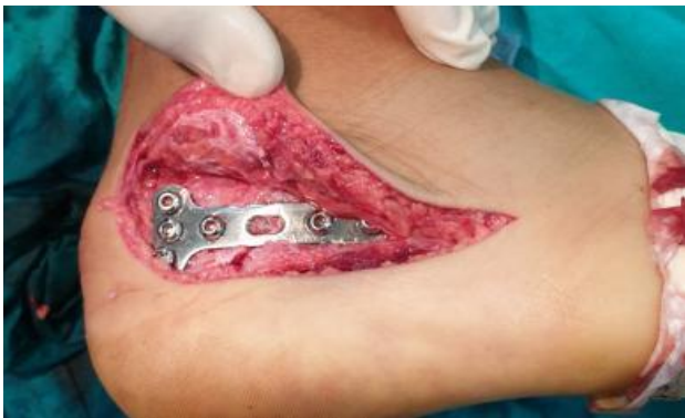
Figure (3): T-shaped plate final fixation.

A small T-shaped plate (3.5 mm) was placed on the lateral wall of the calcaneus to check the proper size and location before fixation, after placement of the plate in the proper position it is fixed with suitable screws (Figure 3).