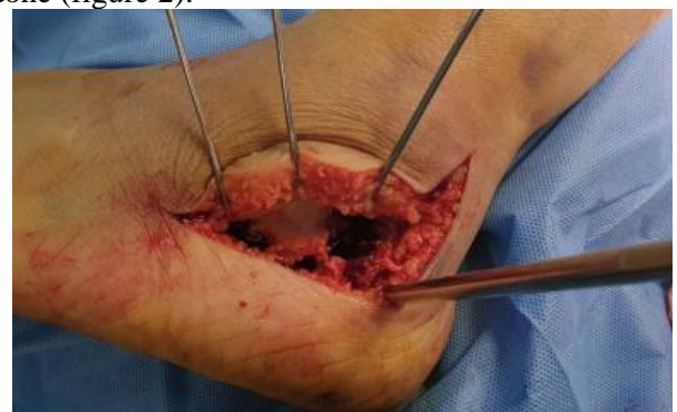
Figure (2): Steinmann pin insertion for traction.

Steinmann pin was inserted (under fluoroscopy guide) from lateral to medial in the inferior part of the posterior of the calcaneus. Reduction is started from medial to lateral then from posterior to anterior and by the tuberosity fragment, then restoration of calcaneal height and length with valgus and varus alignment is done (figure 2).