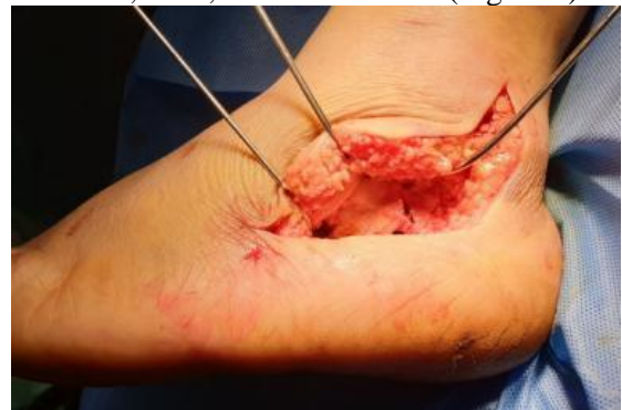
Figure (1): Full-thickness flap non-touch technique.

All patients were operated on spinal anesthesia (15 patients), except in the patients with associated spine injury (3 patients) where general anesthesia was used. A pneumatic thigh tourniquet was used up 300mmHg with pre squeeze to the limb with setting the time of application of the tourniquet. Antibiotic (3rd generation cephalosporin) is given before the application of tourniquet by 30 minutes. Kirschner wires were inserted to hold the skin flap back and perform a non-touch technique, the 3 K wires placed on the fibula, talus, and cuboid bone (Figure 1).