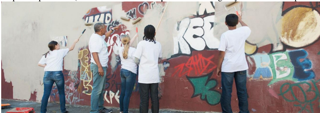
Figure 3 Philadelphia Anti-Graffiti Network (PAGN) team painting over graffiti at Broad and Spring Garden streets.