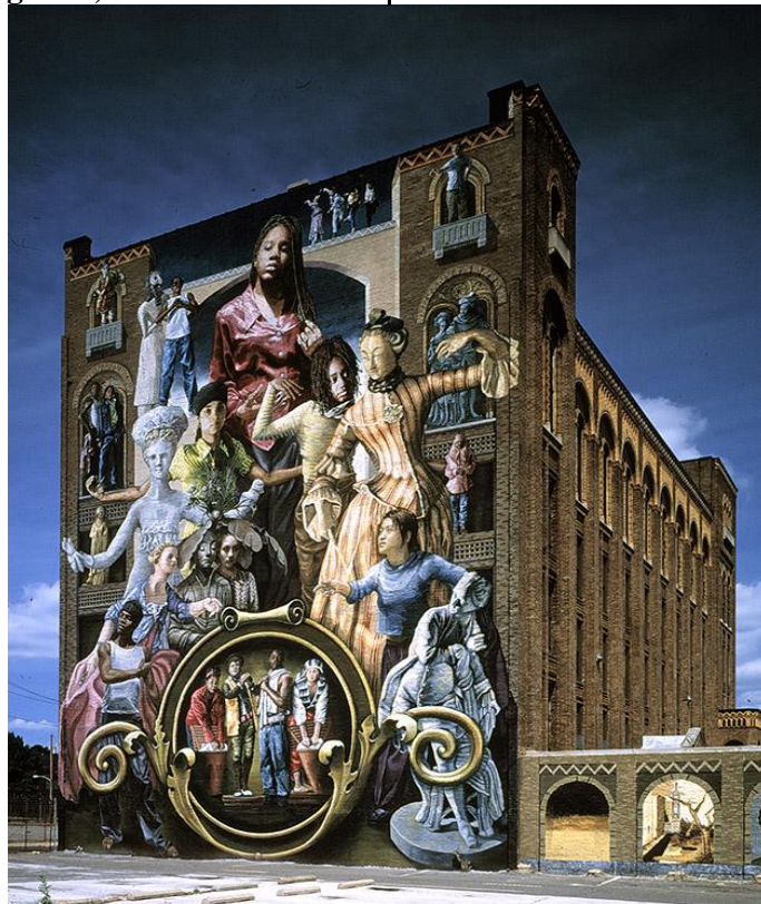
Figure 5 Common Threads by Meg Saligman. Completed 1999.

inside, which is a unique intercultural experience. Migrant Imaginary (Figure 6)