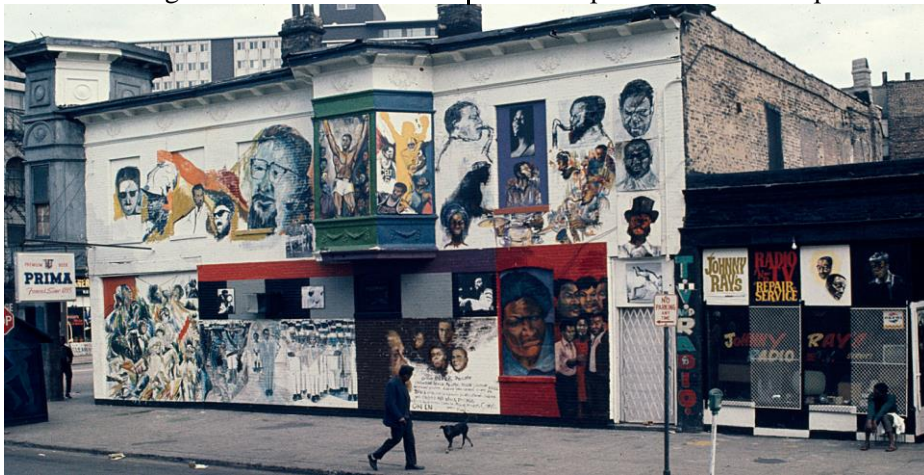
Figure 1 The Wall of Respect.

with a collaborative mural titled "The Wall of Respect" that was completed in August 1971.