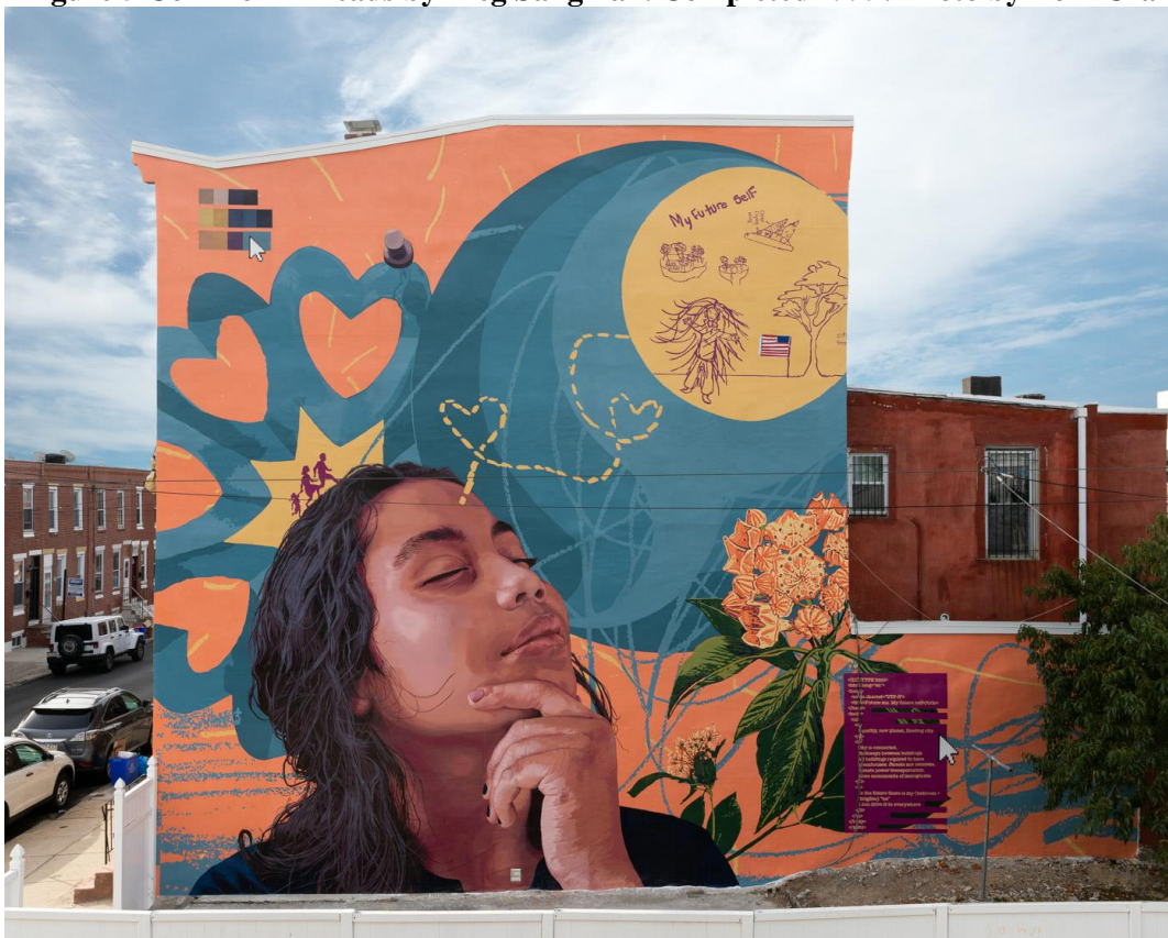
Figure 6 Migrant Imaginary © 2019 City of Philadelphia Mural Arts Program / Layqa Nuna Yawar & Ricardo Cabret, 1902 South 4th Street.

This mural is one of the most recent works of the MAP, it has been completed in October 25 th 2019