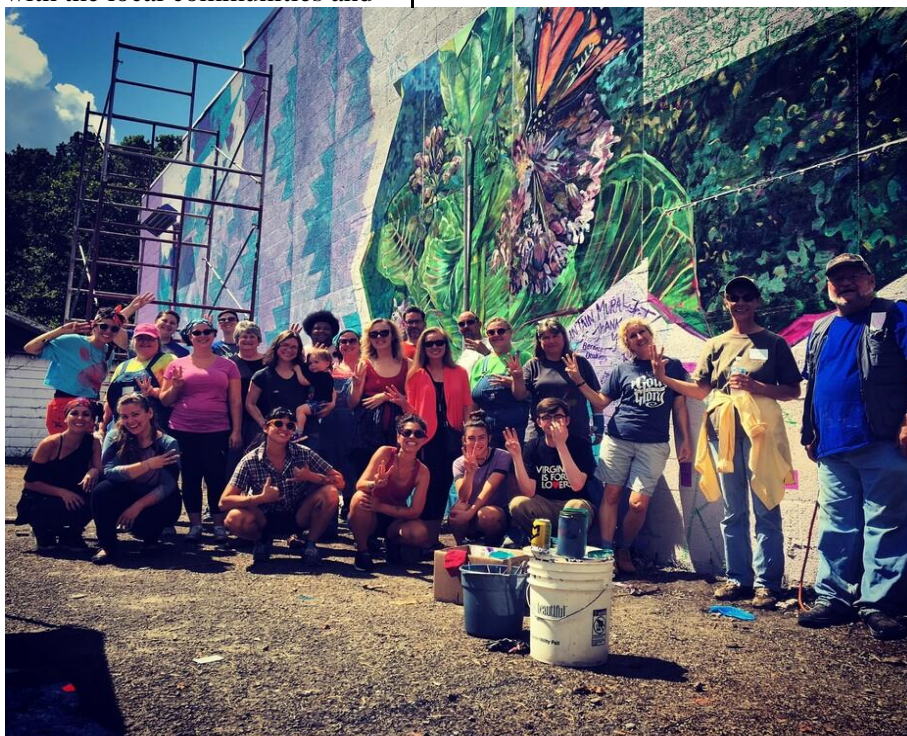
Figure 2 2018 Mural Fest participants, Harlan County Kentucky

HGHC was launched in 2001 in Kentucky, U.S.A, as a community- based art organization that encouraging locals to civically engage in art projects- particularly photography and documentary film- as a form of subtle political resistant to concerning social and cultural issues in their communities (Mullinax, 2012)