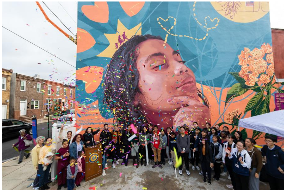
Figure 10 Migrant Imaginary dedication, October 29, 2019.

The city of Philadelphia Mural Arts Program’s Journey and projects are a very inspiring example of Community-engaged Public art practices and their journey could be a road map for artists to achieve their projects around the world.