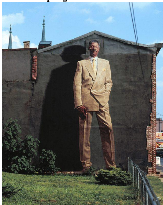
Figure 4 Dr. J by Kent Twitchell.