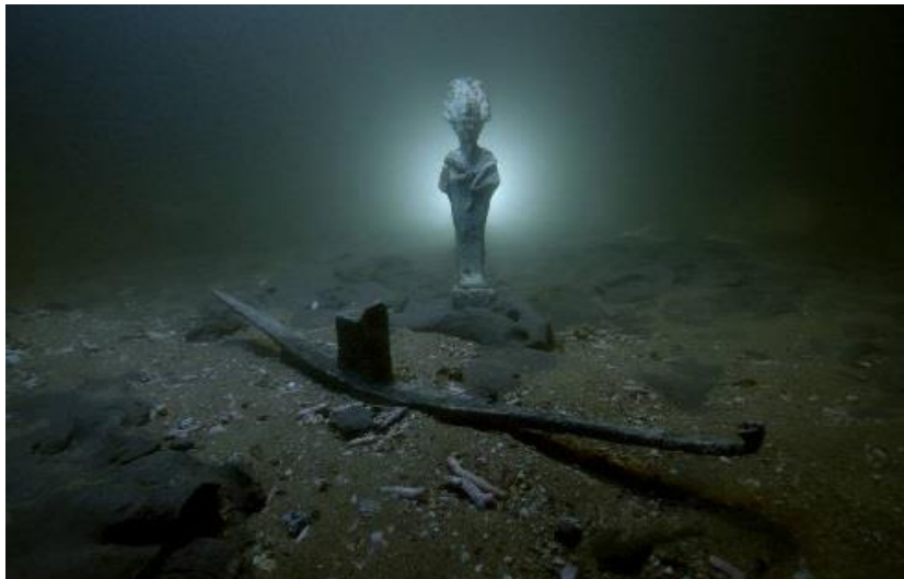
Fig (1) votive bark of god Osiris about 30 cm wide and about 5 cm wide.

In addition, the mission has succeeded in uncovered also a royal head carved in crystal dating back to the Roman-era and probably it belongs to the commander of the armies “Antonio”, in addition to three gold coins dating back to the Emperor “Octavius” Fig (2) in Abu Qir Bay in Alexandria .Also uncovered a votive bark of god Osiris at the Heraklion sunken city in Abu Qir bay Fig (1).