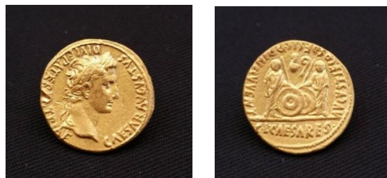
Fig (2) gold coins dating back to the Emperor “Octavius”.