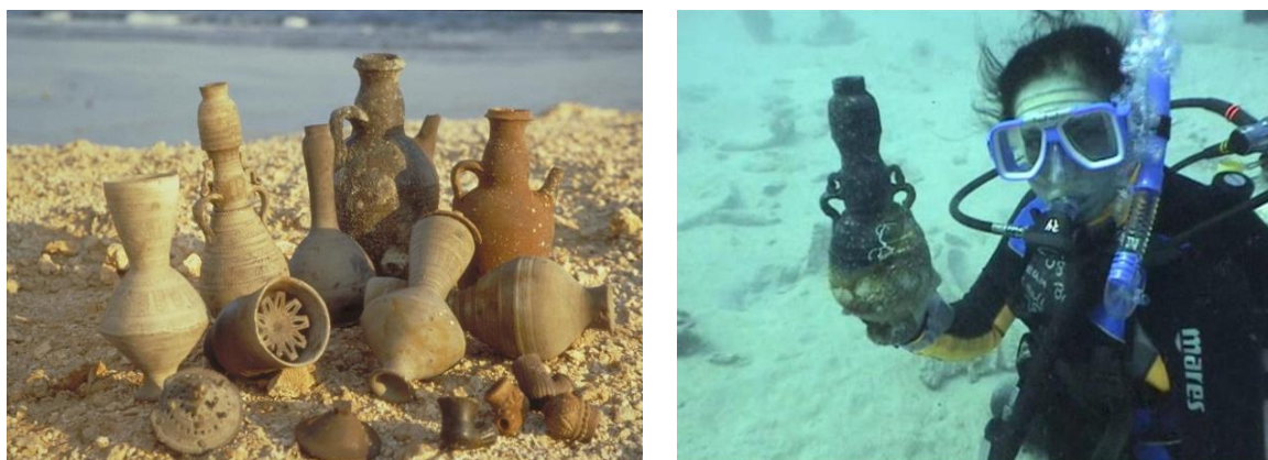
Fig (4) Artifacts found on Sadana wreck

in 1994, the INA-Egypt-SCA Red Sea Shipwreck Survey located an Ottoman-period vessel off Sadana Island near Safaga, about 40 km south of Hurghada, and excavated the wreck during the 1995, 1996, and 1998 seasons. Sport divers in the Red Sea have known of the shipwreck for more than 10 years, and some reported that the wreck was being looted. INA-Egypt decided to excavate the wreck to protect the information that was being lost and to draw attention to its importance to the Egyptian authorities.