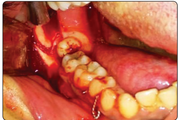
Fig. (2): A photograph showing the intra-operative fractured mandibular angle