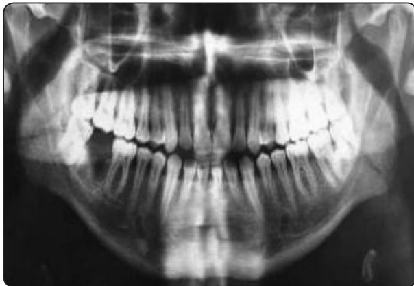
Fig. (1): A panoramic radiograph showing the preoperative fractured mandibular angle

Using Planmeca Romexis viewer ® 5.2.0 software, the same operator generated the required readings twice for each patient at different times to avoid any outer influences and the final average value for each reading was recorded. The mean values were then calculated to assess the inter-fragmentary gap between the fractured segments after fixation which indicates the success of the fixation method and