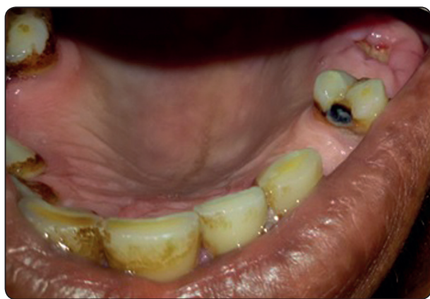
Fig. (1): Preoperative photograph for a case of major autohemotherapy.

The current study was conducted on forty patients from the outpatient department of Oral and Maxillofacial Surgery department suffering dry socket. This study complied with the Declaration of Helsinki (revised in 1975), and the regional ethical review board. All patients provided informed consent. Inclusion criteria included simple extraction (forceps extraction) cases only, age range from 18 to 65 years, and to be otherwise healthy patients. Exclusion criteria included the existence of infected socket, any systemic or local disease affects healing, any bleeding disorder, perimenstrual extractions performed, pregnancy, lactation, the use of oral contraceptives, any hormonal disturbances or smoking. Patients were randomly divided into two equal groups; group I who undergone AHT procedures and group II who received oleozon. In group I patients, the socket was briefly irrigated with 2ml normal saline (0.9% solution) to remove any debris. Figure 1 shows a patient preoperatively. Major autohemotherapy was carried out by withdrawing 225mL of patient's antecubital vein blood into a sterile glass bottle containing 25mL