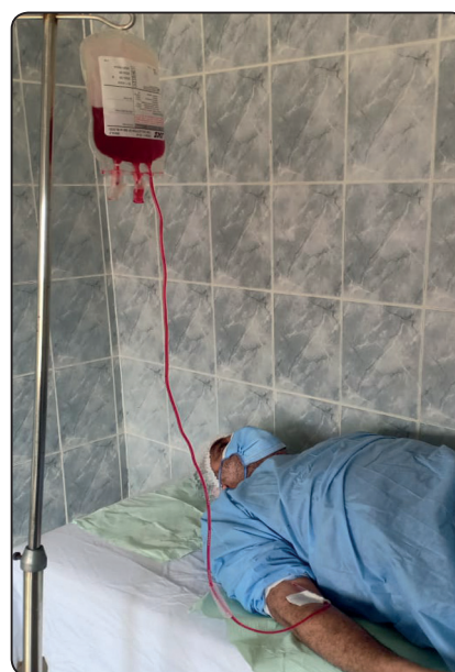
Fig. (3): Ozonized blood reinfusion.