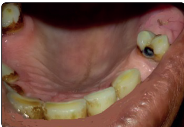
Fig. (6): Postoperative photograph for a case of major autohemotherapy at the fifth postoperative day.