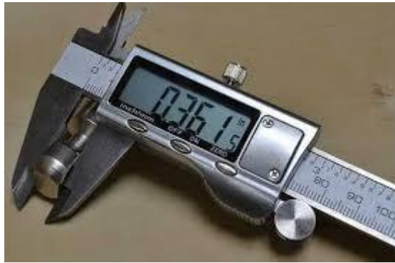
Fig. 1: Neiko 01408A digital caliper graduated scale with LCD screen.