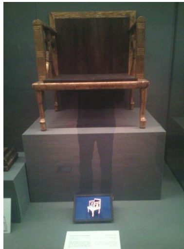
Fig. 2 - Movie of the Reconstruction of the Chair of Queen Hetep-Heres, Taken by Sayed Abuefadi.