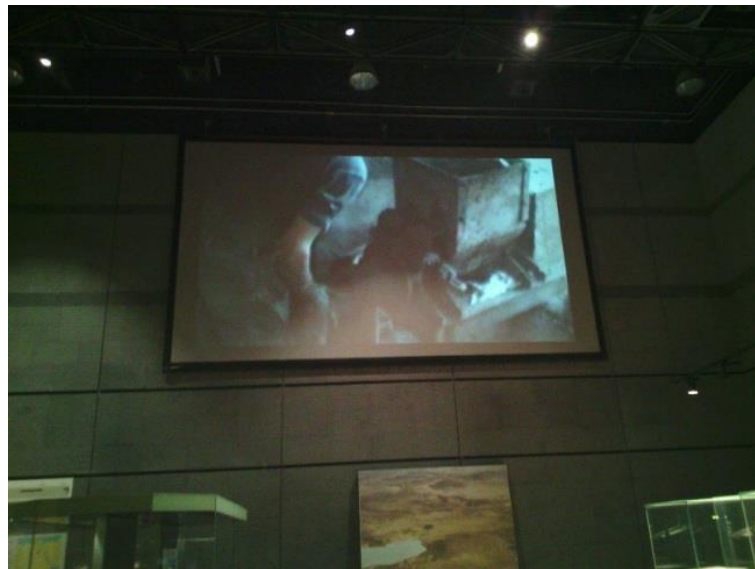
Fig. 5 - Example of Large Screen, Taken by Sayed Abuefadi.

One of the main technology used in the temporary exhibition are 4 large screens show us four movies one for each handicraft at the top of one of the gallery sides. This kind of movies is a mix between the old and the new during the meeting with a group of skilled manufacturers in the field of their industries. These kinds of movies give the visitors a brief information about each manufacturer and give them the time to think in the continuity of the handicraft through the ages.