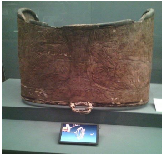
Fig. 3 - Movie of Reconstruction of the Egyptian Chariot, Taken by Sayed Abuelfadl.