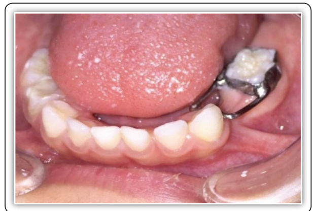
FIG (1) Band and loop space maintainer.

Impressions for group A of the upper and lower arches were made by alginate material, then sent to the lab for fabrication of band and loop space maintainer, Figure (1). Impressions for group B of the upper and lower arches were made by elastomeric impression material, then sent to the lab for fabrication of zirconia space maintainer, Figure (2). A fresh unstimulated whole saliva sample was collected from each patient by asking each child to spit in a sterile container (1st thing after getting up or at least 2 hours after a meal). The samples were collected before the insertion of the space maintainer, after 2 weeks and three months after its insertion. For determining S. mutans salivary levels, mitis salivarius with bacitracin agar was used according to the manufacturer's instructions. The same procedure was used to determine L. acidophilus salivary levels but using selective MRS Agar.