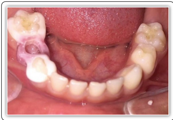
FIG (2) Zirconia band and loop space maintainer.