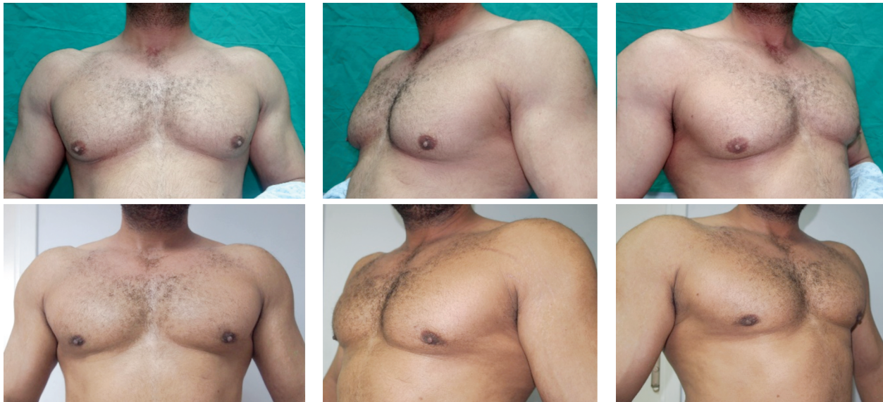
Fig. (2): (Above) Pre-operative views of a 37-year-old bodybuilder with moderate (grade IIa) gynecomastia. (Blow) 2 years post-operative. The glandular tissue together with a film of peri glandular fat was excised through a semicircular infraareolar incision. No liposuction was done.