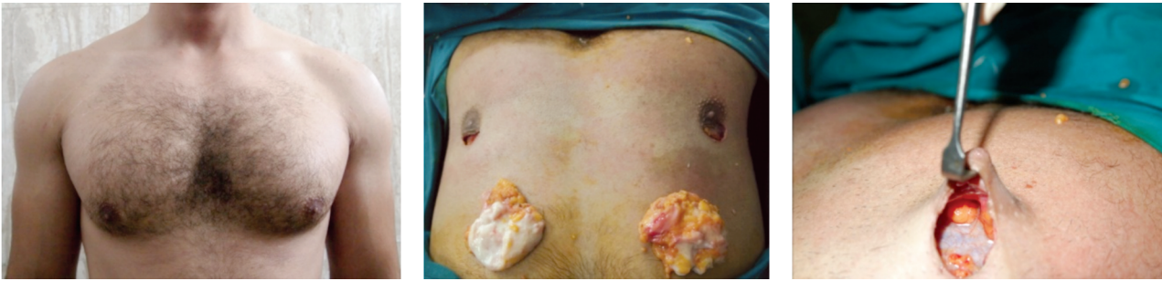
Fig. (1): Bodybuilder with moderate breast enlargement. (Left) Pre-operative standing view. (Middle) Intraoperative view of after glandular excision with a rim of surrounding fat to ensure smooth breast contour. 90gm and 98gm of tissue were excised from the right and left breast through a semicircular infraareolar incision. No adjuvant liposuction was used. (Right) Left side showing the gland bed with preserved pectoral fascia and a thin areolar skin flap.