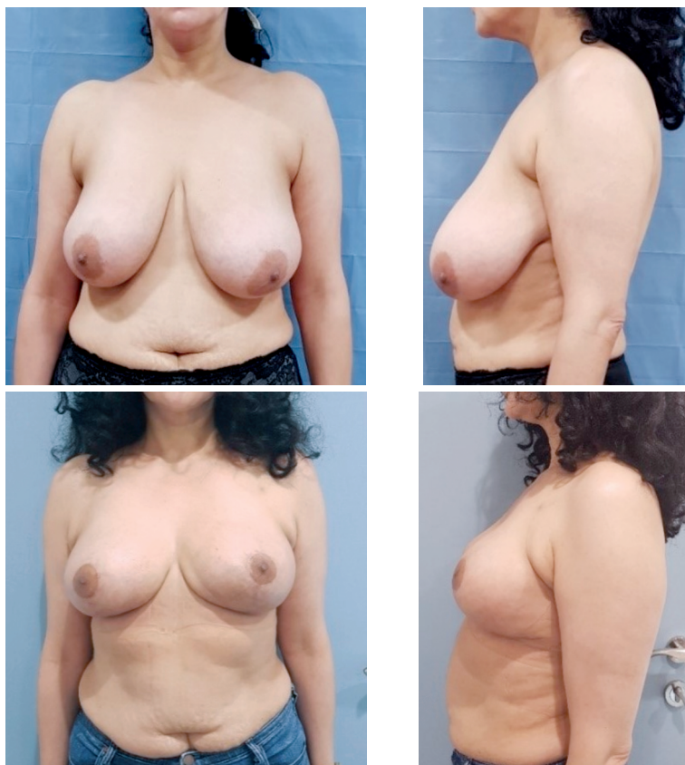
Fig. (2): Front and lateral views of pre-operative and 1 year post-operative follow-up of 55 years old patient.

Regarding post-operative aesthetic outcome according to the satisfaction scale is summarized in Table (2). Contour was not accepted by 2 patients (5.5%), accepted by 9 patients (24.3%) and 26 patients (70.2%) were very pleased. Scars were very disappointing for one patient (2.7%), was not accepted by 6 patients (16.2%), accepted by 14 patients (37.8%) and 16 patients (43.2%) were very pleased. Symmetry was accepted by 13 patients (35.1%) and 24 patients (64.9%) were very pleased. Aesthetic outcome wasn't accepted by 1 patient (2.7%), Accepted by 5 patients (13.6%) and 31 patients were very pleased (83.7%).