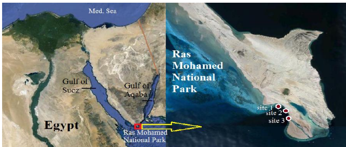
Figure (1): Map of northern Red Sea shows Ras Mohammed National Park and the three selected sites.

different reef flat habitats of Ras Mohammed reefs (Fig. 1) were chosen to observe the territorial behaviour of the surgeonfish.