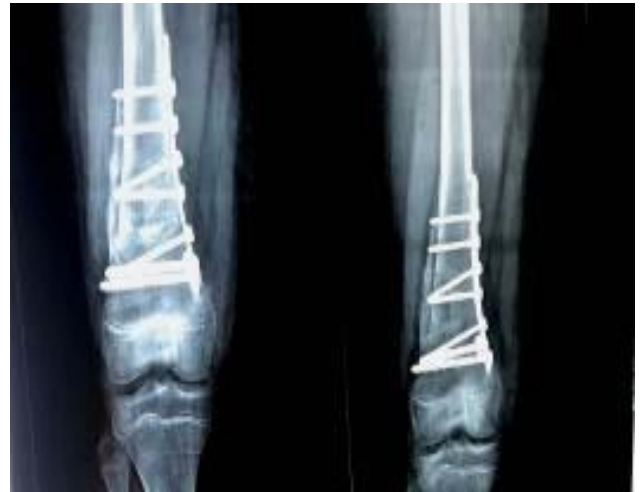
Figure (4): Standing radiographs AP views were taken at 6 months show callus formation and completely healing at site of osteotomy cut.

as tolerated. Removal of the cast after 3 weeks and, active assisted exercises were started. The patient was allowed full weight bearing and more demanding activities as his or her muscle strength and symptoms allow. Patients were reviewed at 3 weekly intervals. Standing radiographs both AP and lateral views were taken at 4 weekly intervals. Follow up period was 6 months.