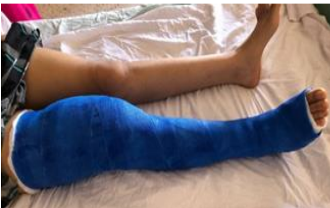
Figure (3): High above knee cast.

Plate position was then verified with AP and lateral fluoroscopy. vacuum drain was inserted and closure of the vastus medialis was fastened back to medial septum with interrupted sutures. The subcutaneous tissue and skin were closed in routine fashion, and compression dressing was applied. High cast above knee was applied in all patients (Figure 3).