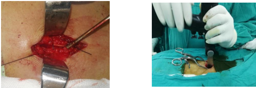
Figure 2: splitted spinus process by saw