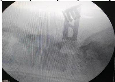
Figure 3: fluoroscopic image for splitting spinous process by saw