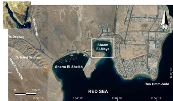
Figure (1): Location map of Sharm El-Maya Bay area and its surroundings. (Sources: satellite image from Google™ Earth, 2010; insert from MODIS/MODLAND/ Descloitres, 2000).

In 1999, nonetheless, Sharm El-Maya Bay area was confronted with an extensive spill of petroleum hydrocarbons directly affecting the beaches and the water of the bay itself as well as its southern headland where the old power plant was installed. The spillage incident took place almost eight months after the components of the old power plant, such as the power generators and the aboveground fuel-storage tanks, were dismantled.