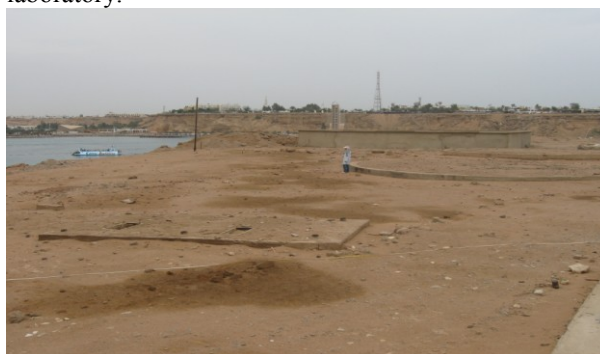
Figure (2): Dark-colored spots of oil-contaminated sediments and concrete foundations of the dismantled power plant units as shown in the northern part of the southern headland.

Seawater samples were collected from eleven different sites in the subtidal zone at depths ranging between one and two meters. Clean bottles of glass, which have small mouth (2-3 cm inside diameter) and contain 50 ml of dichloromethane as a solvent, were immersed to the required depth for seawater sampling. Upon retrieval, the bottles were shaken up vigorously for about five minutes to disperse the solvent. They were immediately stored in an icebox for subsequent treatments in the laboratory.