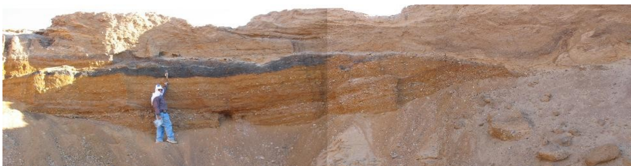
Figure (4): A succession of varicolored sub-horizontal beds of ferruginous (red-colored) and manganiferous (dark-colored) friable sandstones.

sediment sample was put in a clean flask for about twenty-four hours with a mixture composed of equal proportions of dichloromethane and n-hexane, 25 ml each. Extracts of hydrocarbons and solvents were separated in a clean flask using a clean glass funnel and a filter paper. The sediment sample left over from the first run was treated one more time by the same mixture of solvents to obtain another extract. The two extracts were collected in one flask and heated to about 45°C to remove all existing solvents. The remaining dry residue was re-dissolved in a minimum amount of dichloromethane and was stored in a covered glass vial after allowing the added solvent to be completely evaporated. The weight of the extracted hydrocarbon materials was determined using a digital balance. Vials were kept in a dark compartment for further analyses.