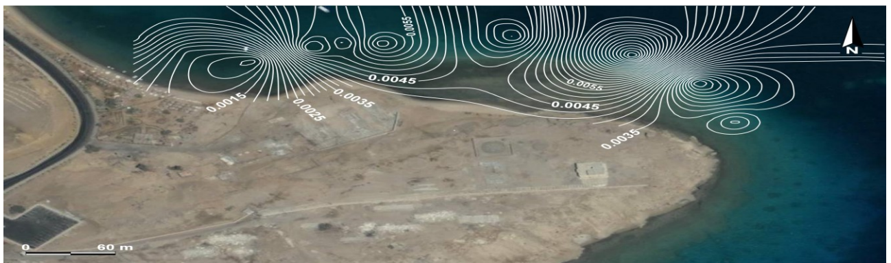
Figure (6): A contour map showing the spatial variations of the hydrocarbon concentrations (%) determined in the seawater of Sharm El-Maya Bay. Contour interval is 0.0002%.

population mean is 37.99 \pm 17.458 mg/L. The computer-generated contour map shown in figure (6) depicts five alternating highs and lows of closed contour lines separated by parallel, evenly spaced, contour lines. The central north-south trough clearly defines the two maxima. The closeness of the contour lines, however, indicates that it has a gentle gradient with the western maximum, which has a high value of 0.0061%, but a much steeper gradient with the eastern maximum, which has a high value of 0.0091%.