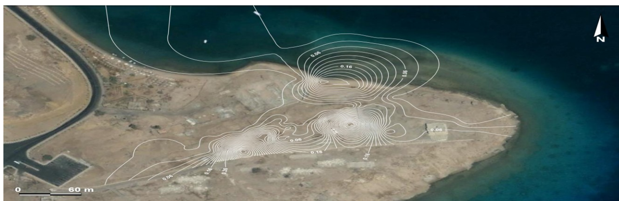
Figure (8): A contour map showing the spatial variations of the hydrocarbon concentrations (%) determined in the headland and the seabed sediments of Sharm El-Maya Bay area. Contour interval is 0.02%.

Spatial variations in the hydrocarbon concentrations of the headland and the seabed sediments are collectively shown in figure (8). The location of the three concentric sets of contour lines strongly suggests that there is a close association between a land-based source of petroleum hydrocarbons in the headland area and the pollution levels recorded in the headland and in the seabed and seawater of the bay as well. The two central maxima are apparently related to damaged-underground structures in which unknown amounts of petroleum hydrocarbons are still stored. The third northernmost maximum located at the beach, however, is related to either the few numbers of control points or most likely to local variations in the porosity and permeability of the beach sediments.