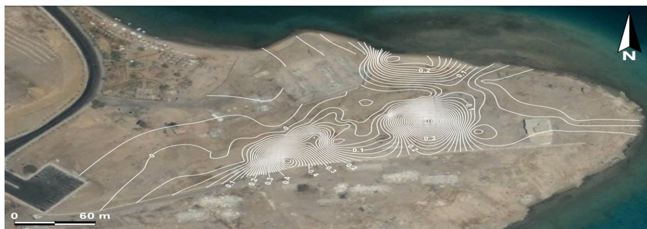
Figure (5): A contour map showing the spatial variations of the total hydrocarbon concentrations (%) determined in the headland sediments of Sharm El-Maya Bay area. Contour interval is 0.02%.

The computer-generated contour map shown in figure (5) indicates the presence of three maxima at 0.26, 0.52, and 0.56% around which semi-circular contour lines close unless they are truncated by the shoreline or any manmade structure. A north-south trough of relatively widely spaced contour lines separates the two maxima located in the central part of the map. The two maxima, however, have closely spaced concentric contour lines depicting a relatively steep northern gradient where the highest data value (either 0.52 or 0.56%) is very close to the lowest data value (0%). The truncated contour lines of the northern maximum (0.26%) located at the sandy beach have a relatively gentle southern gradient. They are separated from their counterparts in the south by an ENE-WSW trending trough of low-values contour lines.