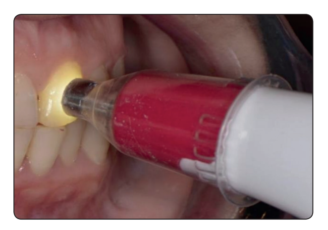
Fig. (1) Color change assessment

Visual color assessment was performed using the Vita Easyshade Spectrophotometer Compact (Vita Zahnfabrik, Bad Sa"ckingen, Germany) Odaira et al.(2011)8. Calibration of the device was done before each appointment with the aid of white table given by the manufacturer. Each white spot lesion was measured by holding the probe tip at a right angle to the whole surface and the values were reported as shown in figure 1. To minimize measurement errors, the assessments were repeated three times, and the mean values of three consecutive measurements were recorded for each area. Only the L* value was captured in this study. The L* axis describes the degree of lightness inside the sample and it ranges from 0 which denotes black to 100 which denotes white. Thus, the higher the L* value, the whiter the lesion, which indicates a higher degree of enamel demineralization. On the other hand, lower L* values