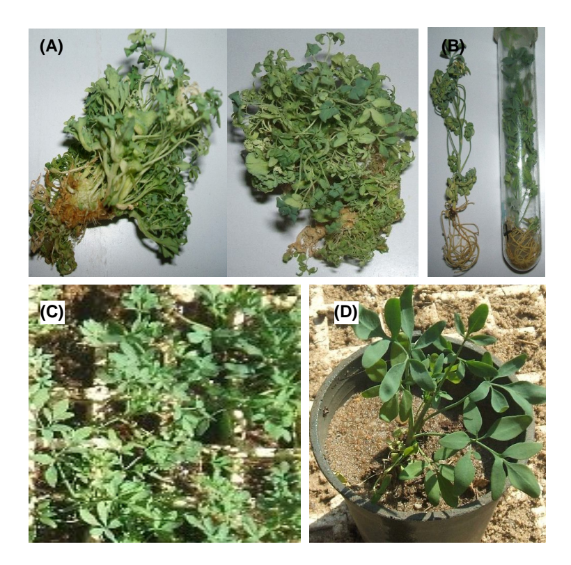
Figure (2): Micropropagation and acclimatization of Ruta graveolens : (A) Multiplication of cultures with BA and NAA, (B) Root development, (C) Successful hardening of rooted plantlets after 3 weeks, and (D) Plants under plastic green house conditions.