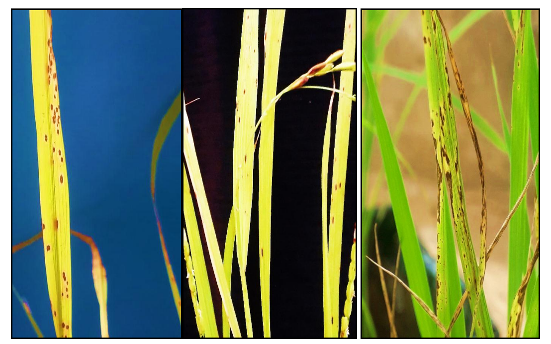
Figure 2. Brown spot symptoms in the artificially inoculated leaves

Infected rice leaves were recognized with the appearance of lesions that are initially dark brown to purple-brown, light brown to gray center and reddish-brown margin on the leaves (Figure 2).