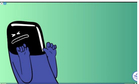
Fig.6. Symbolic aspect in limited animation - Tahaleb - Facebook - Episode 9 "Ahmed Alaadi" - 2020