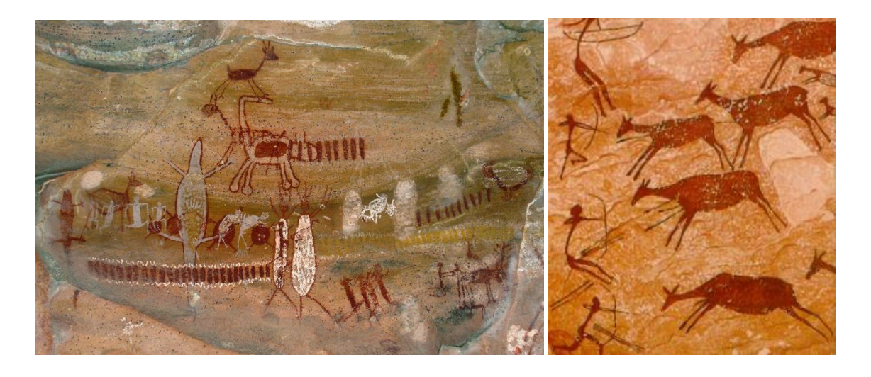
Fig.4. painting cave - Spontaneous aspect: