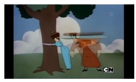
Fig.2. The Stretch system -The Dover Boys at Pimento University or The Rivals of the Roquefort Hall-1942