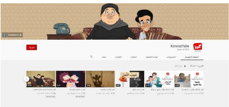
Fig. 8. "Konooz" – Facebook and YouTube - 2018