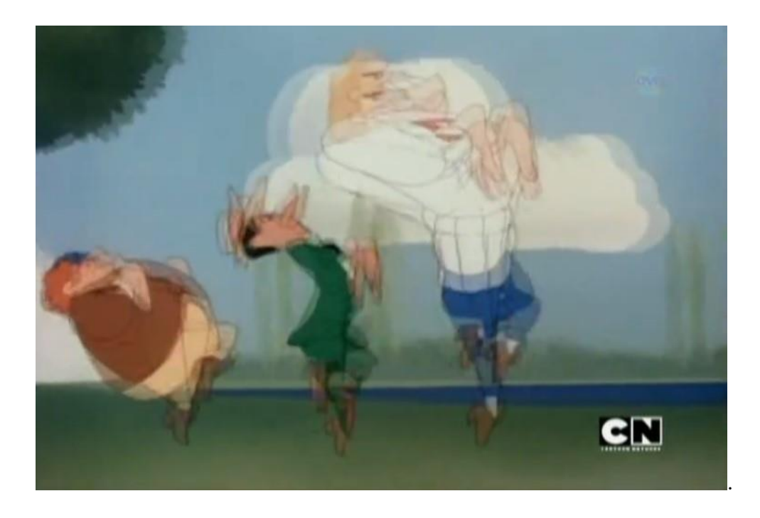
Fig. 1. the staccato system- The Stretch system The Dover Boys at Pimento University or The Rivals of the Roquefort Hall- 1942

the artist Pablo Picasso and the artist Mattis, where the presence of low-number tires and the simultaneous entanglement of static images make the effect of the syntactic graphics