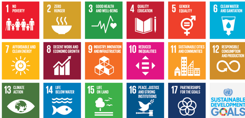
fig (2)- Sustainable development goal ( source : https://en.unesco.org )

By deeply analyzing the SD goals, it's clear that most of the goals showed in (Fig 2 ) can be categorized in to two main directions when linked with designed trends as shown in table (1):