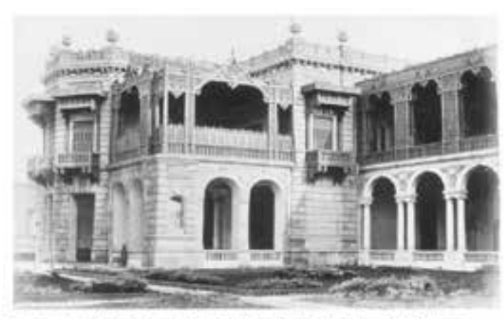
Figure 36. Khedive Ismail's Giza palace, home of the Egyptian Museum, 1890–1902. Photograph No. 99 by Félix Bonfils. In the photo album entitled "Egypt and Palestine," Courtesy of Rare Books and Special Collections Library, The American University in Cairo.