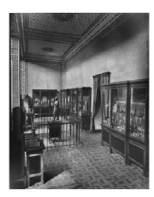
Figure 2: Salle du centre (neflatérale) at the Boulaq Museum in Cairo, 1872. Doyon, "The Poetics", 1-37.