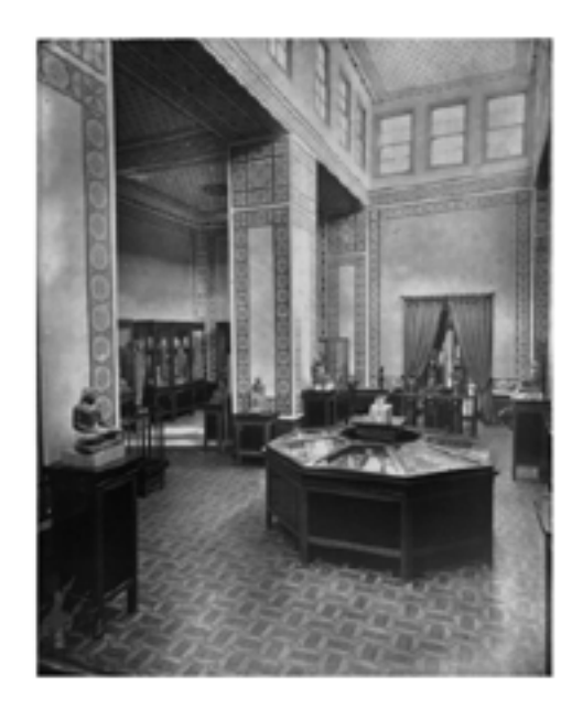
Figure 1: Salle du centre (nefprincipale) at the Boulaq Museum in Cairo, 1872. Wendy Doyon, "The Poetics of Egyptian Museum Practice", The British Museum studies in ancient Egypt and Sudan 10 (2008): 1-37.