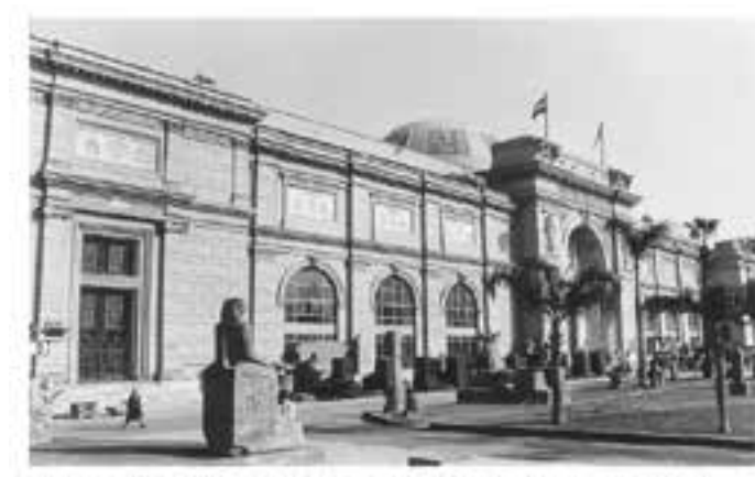
Figure 2. A measument to Western Egyptology: the Egyptian Museum, Cairo, inaugurated in 1902.