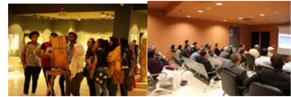
Fig:6 the photos show Illiteracy Lessons and training for Sohag community by museum curators and educators), Photo by Sohag Museum Curator 2018.

The idea of learning in the community utilizes the sense of social cohesion and empowers the economy. Sohag museum had long programs for lifelong learning for Adults in cooperation with civil society associations.