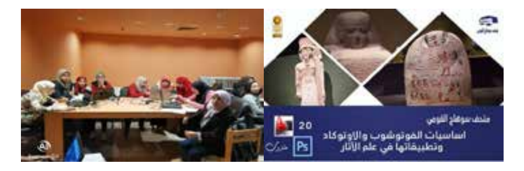
Fig: 7 the photos show Lifelong learning for Adults "ICT workshops on Photoshop by specialist" in Sohag, Photo by Sohag Museum Curator 2019.

Societies face competition. In the Global market of the Nordic countries, lifelong learning is seen as an additional development of popular enlightenment, linked to democratic social ideas about welfare and equal opportunity. Several Adult educational presentations, such as, evening schools, summer schools, open institutes, colleges etc, highlight the position of the Nordic countries as a prominent place in international statistics of adult education, and The field of education becomes one of employability: to increase personal flexibility in accordance with the ever-changing demands of the workforce in the so-called "knowledge society".