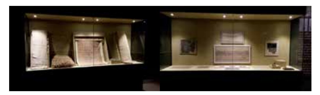
Fig. 7. The photo shows the 5th gallery "Pharonic textile and Islamic collections showcase"

The museum has set a gallery with different textured textiles from different eras including ancient Egypt and the Ottoman Empire. Textile-making was a craft that was mastered by all society members. It was carried out in most houses or under the supervision of the government in workshops attached to temples as shown in the temple of king "Seti I" in Abydos which indicated the idea of workshops being attached to temples. As linen textile was essential and expensive, it was inherited within families. Families used to produce their needs and exchange surplus with other products for day-to-day needs. "Fig.7"