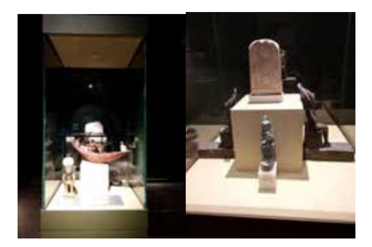
Fig. 6. The photos show the ground floor gallery show collections, the idea of Pilgrimage in Ancient Egypt to Abydos and God Osiris.

The museum has set a gallery with different textured textiles from different eras including ancient Egypt and the Ottoman Empire. Textile-making was a craft that was mastered by all society members. It was carried out in most houses or under the supervision of the government in workshops attached to temples as shown in the temple of king "Seti I" in Abydos which indicated the idea of workshops being attached to temples. As linen textile was essential and expensive, it was inherited within families. Families used to produce their needs and exchange surplus with other products for day-to-day needs. "Fig.7"