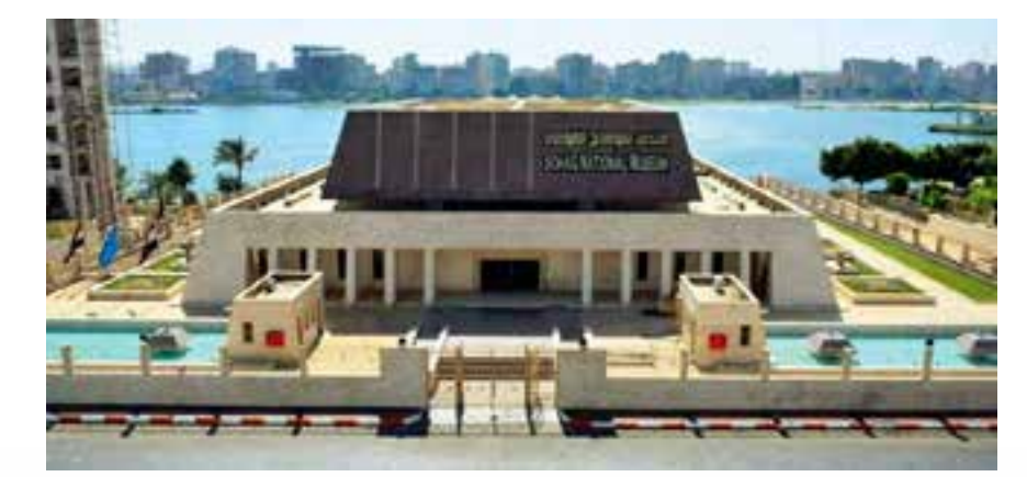
Fig. 1. the photo shows Sohag national museum building and land escape.

In 1989, the governor of Sohag made a regulation for building a regional museum in Sohag and devoted about 56.000 square meters close to the Nile River which is a real distinguished location. The work started in 1993, and then it had been stopped in 1996 due to the technical and interior design issues. The work resumed in 2006 and stopped again in 2010. In 2015, the head of the Egyptian Museums' Sector in cooperation with the head of the projects' sector at the Egyptian Ministry of Antiquities studied the financial situation of the museum. In 2016, the work was resumed. The Museums' Sector has taken the necessary steps in cooperation with the projects' sector with the aim of improving the accessibility of Sohag Museum. Museum accessibility is a vital element where it is merged by which product, device, service, environment, and knowledge are available for all people irrespective of age, social level, educational or culture level, sex, or disability<sup>8</sup>. "Fig 2"