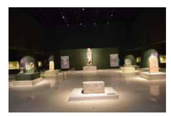
Fig. 4. photo shows middle space between the six rooms'.

The Sohag National Museum consists of two floors. The first floor consists of six exhibition galleries presenting certain kings and important personalities in the history of Egypt with a focus on Upper Egypt. There are three galleries on each side, while each gallery illustrates a different theme. The middle space between the six rooms' displays several royal statues representing the different historical periods in ancient Egypt. "Fig4"