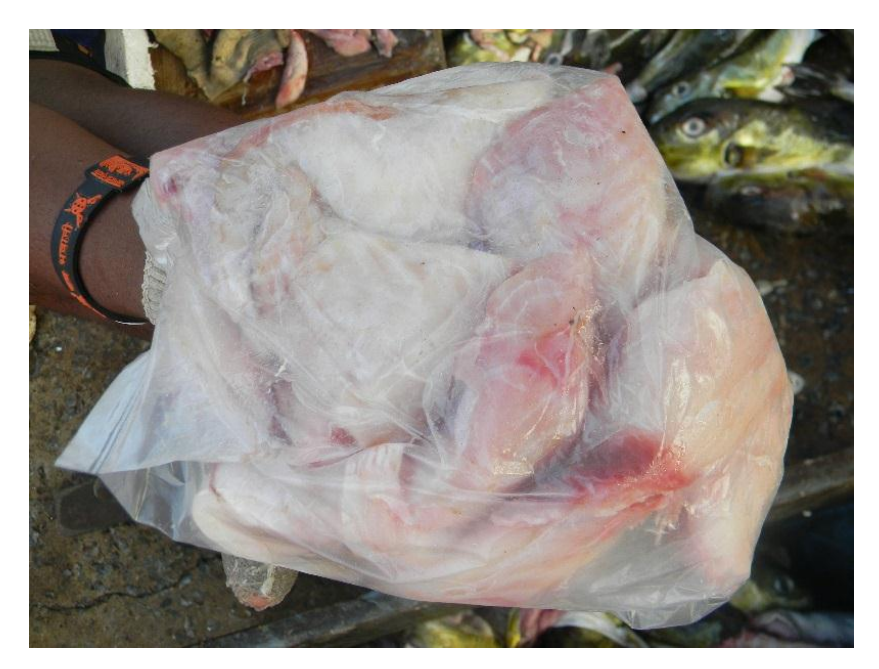
Fig. 5. Processed and packaged flesh of Lagocephalus inermis

beheading and degutting, the price increases by 1.5 fold when considering the dressing loss of 30-40%. The viscera and head are traded separately at price of INR 15-20/kg and it is bought by the local fish meal plants which are used for making poultry feeds. It was found from the interviews that the ovaries of the fish are separated, salted and sold at a price of INR 10/kg to the pharmaceutical industries, however no information is available on its utilization. There are three ways of trading the flesh of this fish. In the first instance it is sold at a price of INR 60/kg and in the second one, it is further washed, cleaned, cut into smaller pieces, packed and then sold at a rate of INR 80-100/kg (Fig. 5). While, in the third way, the flesh is salted at a ratio of 1:1 and stored till the dry fish is demanded. When the demand exists, the fishes are taken out and sun dried for 3 days, packed in gunny packs and sold at a price of INR 70-100/kg. All the products are transported to the neighbouring states since there is no local demand for this fish except for few fisher folks from Tamil Nadu who locally consume it.