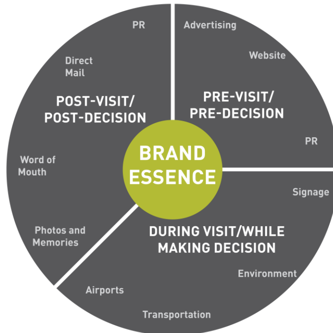
Fig. 3 Touch points to deliver on the brand

Step 7: Execute the strategy; in developing your brand-based marketing plan, it is critical to think about every point at which the target audience may come into contact with your brand. Every interaction or point of contact with the target audience is an opportunity either to enhance or denigrate your brand. These points of contact, or touch points, may include a wide spectrum of elements such as the physical environment, the airport, street signage, advertising, brochures, web site, events, media and even the attitude of residents.