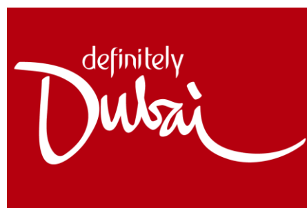
Fig. 4 New Brand Dubai Signature

In Dubai, many slogans are used to promote the area; however the slogan that the Dubai Department of Tourism and Commerce Marketing use is “Nowhere like Dubai”. The brand identity that was launched on May 5, 2009 includes the tagline ‘Definitely Dubai’ and the following brand signature 14 .