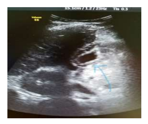
Fig. (5) USG abdomen showing GB wall edema [22].