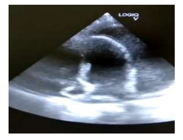
Fig. (1) 2decho showing pericardial effusion, [15]

Optic nerve sheath diameter also has been shown to be associated with results of magnetic resonance imaging. Comparing ultrasound optic nerve sheath diameter with the same MRI derived parameter, investigators have found a moderate correlation (r = 0.02, p< 0.05). These findings have strengthened the usefulness of ultrasound derived prediction of intracranial pressure [19].