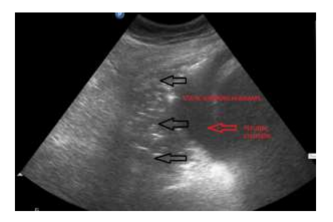
Fig. (4) Ultrasound lung depicting static bronchogram [21].

Ultrasound guidance has been demonstrated in patients with a previously blind technology to help doctors during paracentesis. Different other studies have shown that ultrasound-oriented paracentesis is useful to achieve a higher success rate. Hemoperitoneum is a major paracentesis complication. In a study the complication rate was reduced from 1.25% in the traditional blind cohort to 0.27% in the ultrasound cohort [24].