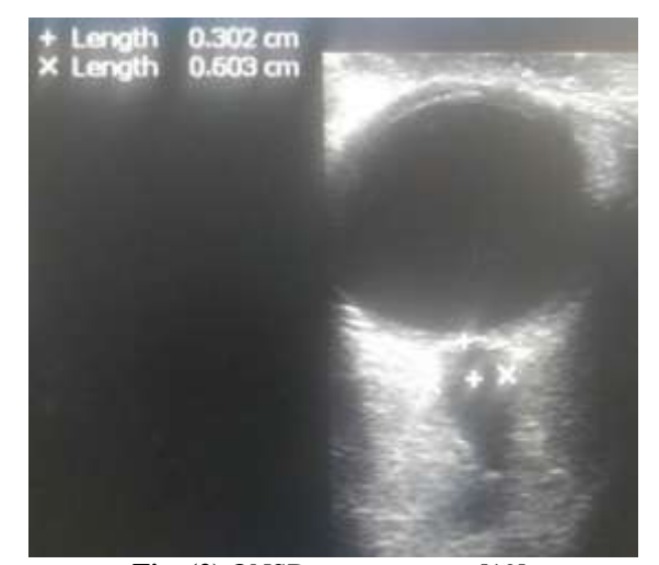
Fig. (2) ONSD measurement [19].