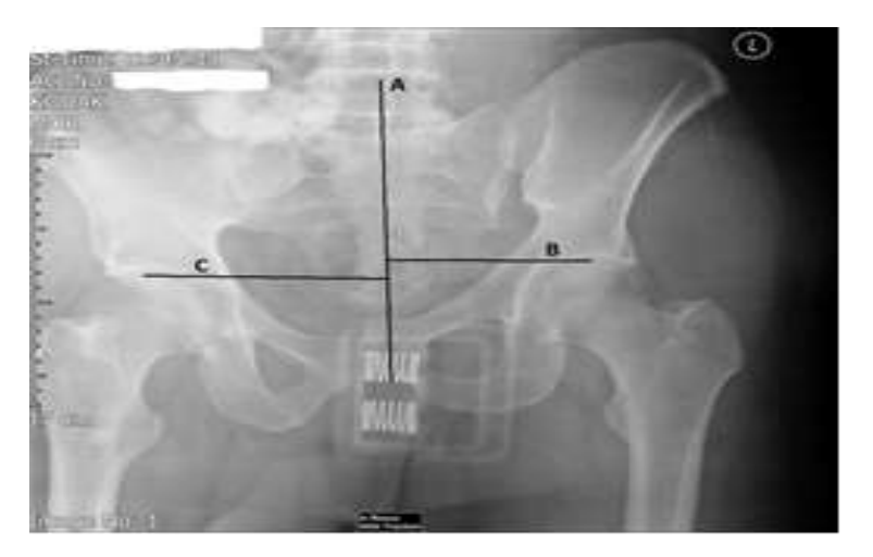
Fig. 1: A preoperative AP radiographs showing a Tile C1 pelvic injury. Line A represents a line passing through the axis of the sacrum. Lines B and C are drawn from the highest points of the femoral heads perpendicular to line A. The difference between the height of both femoral heads represents the vertical displacement of the affected hemipelvis.[17]

Pre-operative AP radiograph, high quality CT pelvis (2 mm cuts) with 3d reconstruction were done routinely, post-operative x-rays within the first postoperative week and before the patients were discharged from the hospital. Follow up radiographs were taken at 6, 12 weeks and six months postoperatively. The radiographs were assessed for fracture healing, vertical displacement, and the quality of reduction. The post. Reduction x-rays was graded according to Matta and Tornetta (17), into [fig. 1]: Excellent: residual vertical displacement less than 5 mm. Good: residual vertical displacement from 5 to 10 mm. Fair: residual vertical displacement 11-20 mm. Poor: residual vertical displacement more than 20 mm.