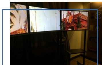
12 picture taken by the researcher

Historical time line, panorama of real scenes and sites. Moreover, it has introduced a new concept for developing multimedia to take advantage of this huge display area. It has benefited from the standard equipment of the ordinary workstation, and regular video display screen (projectors) in addition to the implementation of the semicircular screen using flat projection screens. Culturama is made by made using that familiar equipment (center for documentation of cultural and natural heritage 2016) (2) .