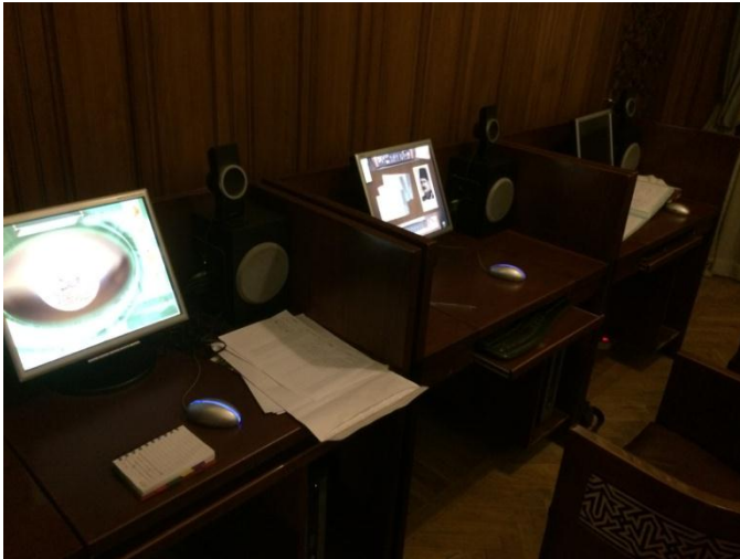
1picture taken by the researcher

Banque Misr gave much care to digitalize the collected heritage of Banque Misr which is more than 100 years old, through data base and different multimedia tools in order to allow researchers and visitors to know in details about the Banque Misr, by different methods.