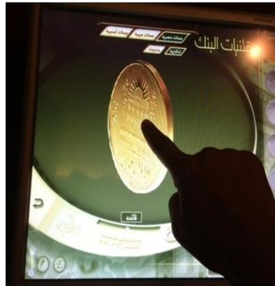
5 picture taken by the researcher