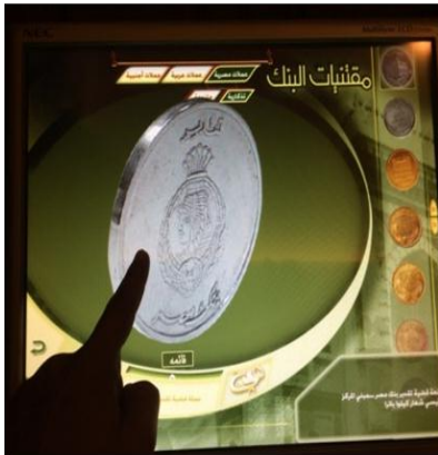
4 picture taken by the researcher