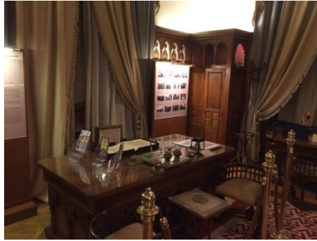
21picture taken by the researcher