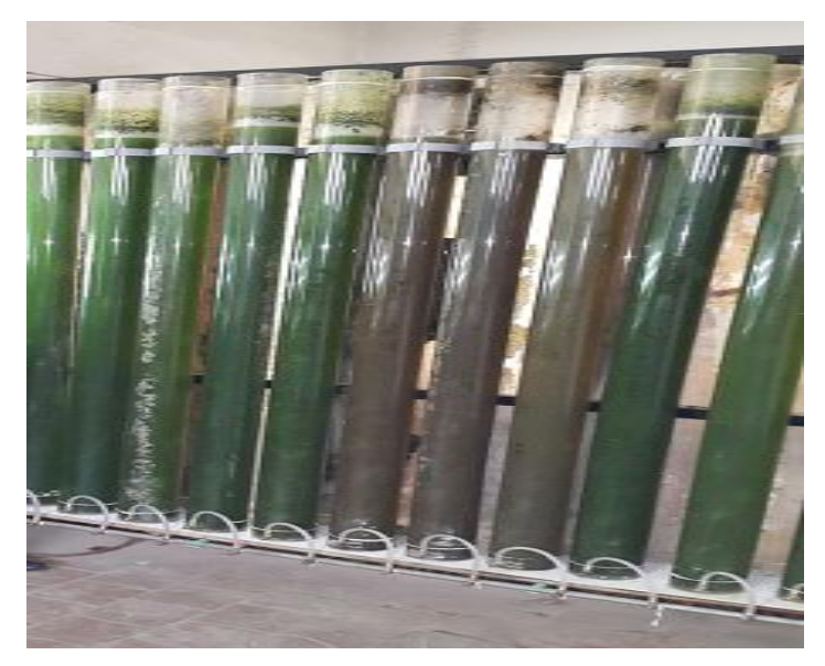
Fig.1: Laboratory growth units a) 110 mm in diameter with 14 L capacity

(Ma and Zauzag, 1942) and crude protein was estimated by multiplying the nitrogen content by 6.25. Carbohydrates were determined by white phenol method ( Dubois et al. , 1956); while oil was determined by soaking followed Soxhlet technique (El-Sayed et al. , 2020). Samples were calcinated at 500°C for ash determination. Moisture content was determined by oven drying till constant weight.