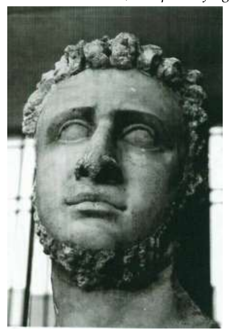
FIG.4 . Portrait of Ptolemy IX in Boston, Museum of Fine Arts 59.51:ASHTON, Ptolemaic Royal Sculpture , Cat. 21.