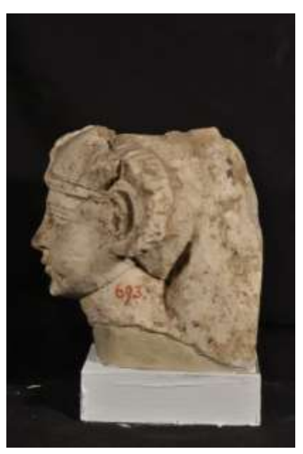
C- left side view.