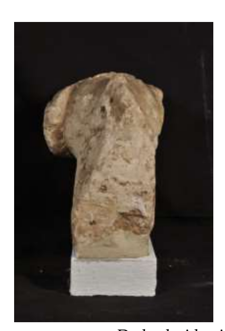
D- back side view.