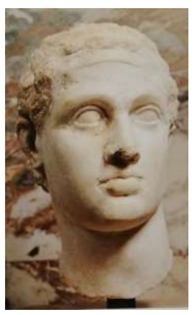
Fig.3 . Portrait of Ptolemy XII in Louvre Museum no. 3449:WALKER, Cleopatra of Egypt , Cat.21,22.