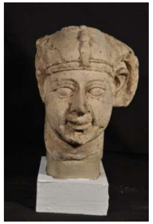
a- frontal view.