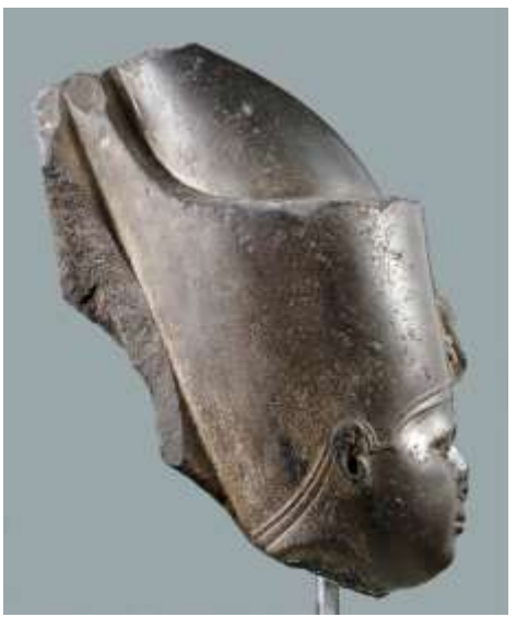
Fig.5. Portrait of Ptolemy VIII (front and profile), Egyptian, Ptolemaic, mid-2<sup>nd</sup> century B.C. Black diorite, h. 18½ in. (47 cm) (preserved). Musées Royaux d'Art et d'Histoire, Brussel.