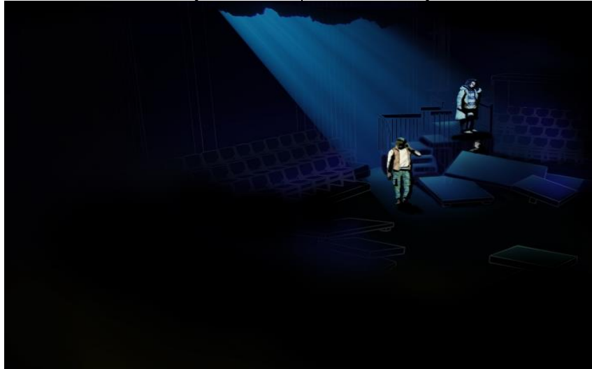
Figure (1)

to depict the hostile effects of human trash on the everyday landscape as well as animals. They assembled around 500 plastic containers through endowments across grounds to make the sculptural rooftop part. The whole of the containers will be reused close to the completion of the show. ("Sustainable Theatre Practices Theatre & Sustainability", 2021)