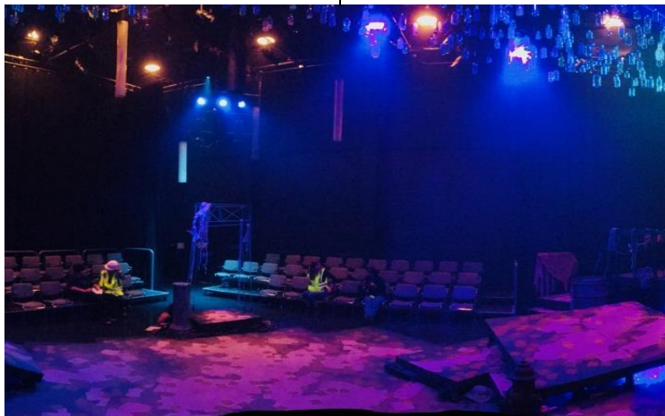
Figure (2)

In the production of "dark water" the lightning designer put in efforts to reduce the use of electricity and resources by using new technology and efficient lighting system. They replaced the old bulbs with less consuming led bulbs with consumed a lot less power than the previous high voltage bulbs. (Walters in Rowan, 2015, p. 99)