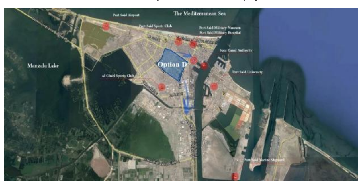
Fig(8) Proposed Olympic city location analysis (OPTION D)

Hosting is also main point as this location has a lot of new housing zones and inactive lands which can be used to build new hosting facilities to host the Olympic events