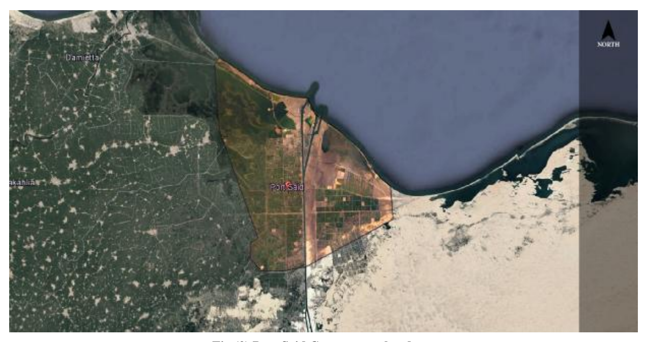
Fig (2) Port Said Governorate borders

In the next section a site analysis will be conducted. In order to determine the best location for urban development, the city attractions will be mapped through multiple location options and therefore assessed.