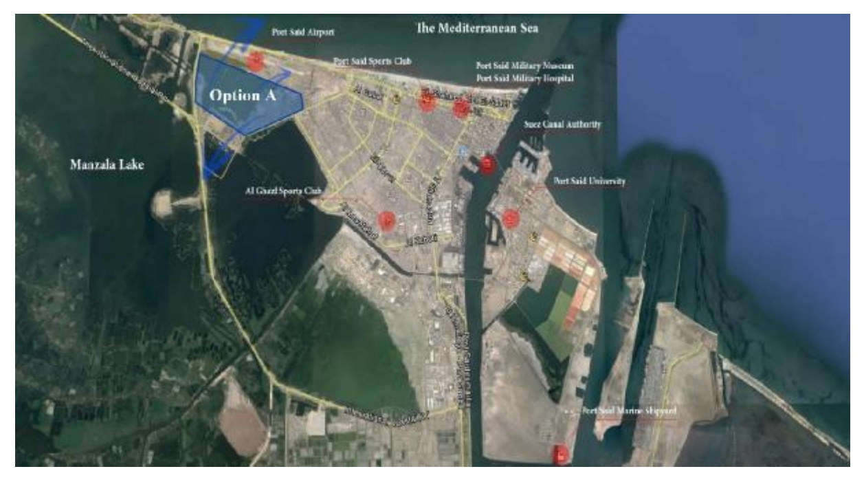
Fig(5) Proposed Olympic city location analysis (OPTION A)

The selection of this place for the Olympic city is based on some nearby facilities, first of them is Port Said Airport which connects the other countries with Egypt. Then International Costal Road which connects the other cities with Port Said, also this place is very nearby to the Mediterranean Sea.