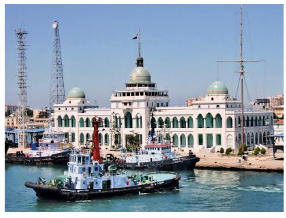
Fig (3). Suez Canal Authority

The fast urban expansion of the city was controlled by an urban development plan, reflecting the contemporary French model for new towns. The regular plan was implemented by the Suez Canal Company (today Suez Canal Authority), from 1861 on. Its urban grid was oriented parallel to the axis of the future Suez Canal and aligned towards the coastline of the Mediterranean Sea in the north. The vast octagonal plan, with its rectangular street grit of 15 and 30 meters wide streets, was firstly built without a division into plots.