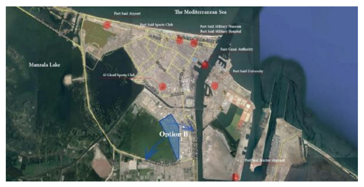
Fig(6) Proposed Olympic city location analysis (OPTION B)

This place is selected to be for the Olympic City because of it is so near to the International Costal Road also Al-Ismailia - Port Said Road.