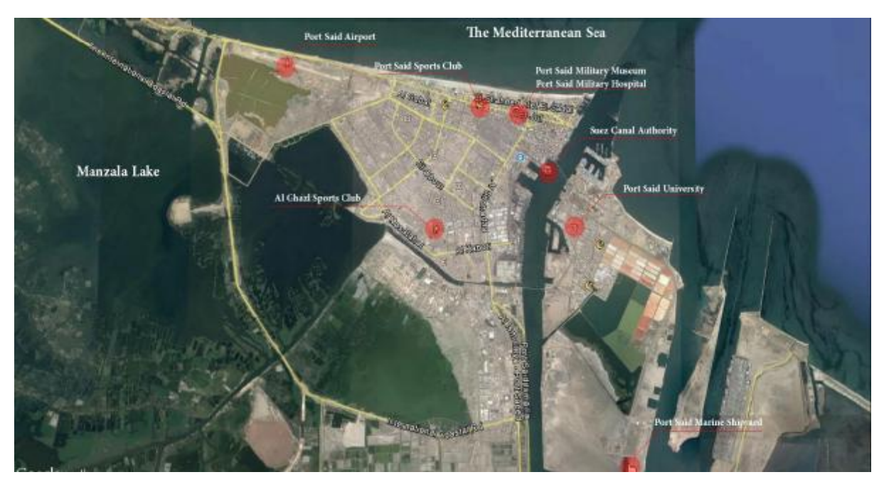
Fig(4-1) Port Said Major Landmarks