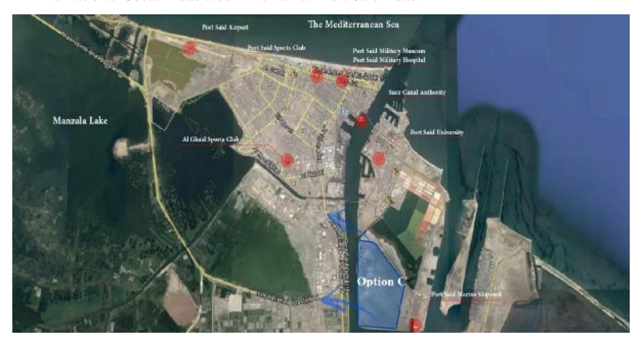
Fig(7) Proposed Olympic city location analysis (OPTION C)

Also this option is selected to be for the Olympic city because of being nearby to the International Costal Road also Al-Ismailia - Port Said Road.