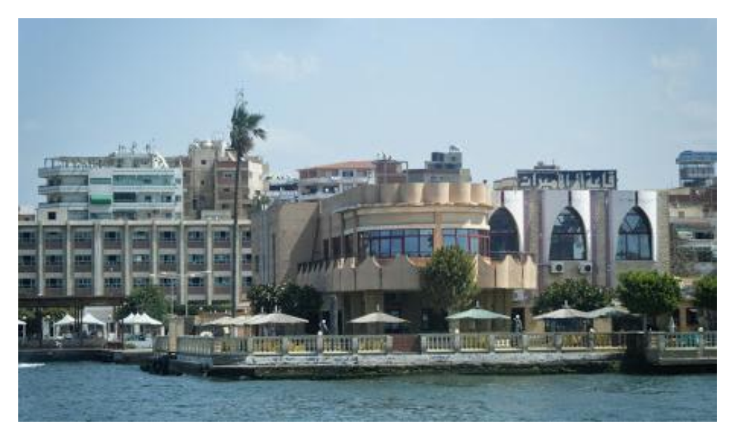
Fig (4-4) Port Said Military Museum